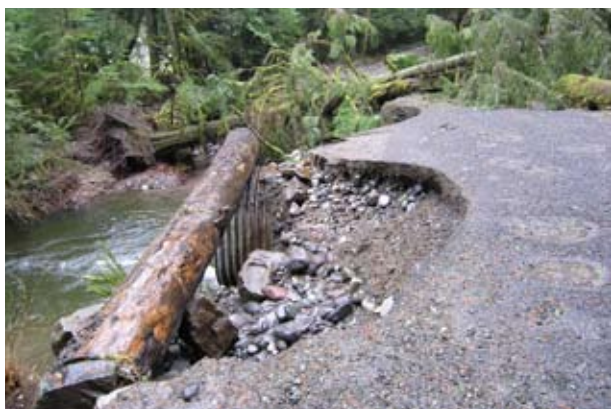
The November 2006 flood caused extensive damage to the Carbon River Road.

In November 2006, 18 inches of rain fell on Mount Rainier in 36 hours. Many park roads were flooded, including the Carbon River Road which was severely damaged and completely washed out in some areas. Due to the history of repeated flood damage to this 5 mile road, the park long range plan states it will be closed after the next major washout.