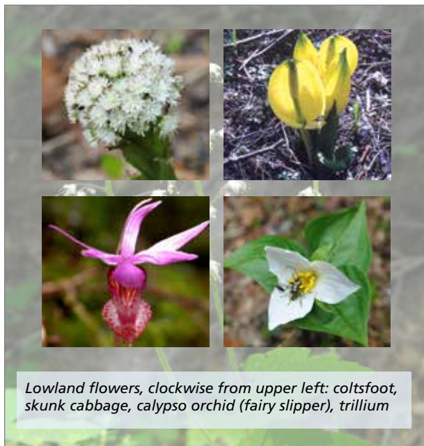
Lowland flowers, clockwise from upper left: coltsfoot, skunk cabbage, calypso orchid (fairy slipper), trillium

Spring comes slowly to the mountain. The sound of falling water marks the warmer days, although snow flurries in May and June may have you questioning the season. Yet in time, spring does arrive. You will see signs of spring while traveling through the park. Make time to let Mother Nature entertain you and you will be richly rewarded. For example, this is perhaps the best time of year to view waterfalls such as Christine and Narada Falls, as they brim with sparkling clear water fed by melting winter snow. Green leaves burst from their buds, mushrooms carpet the forest floor, and birds arrive back at the mountain.