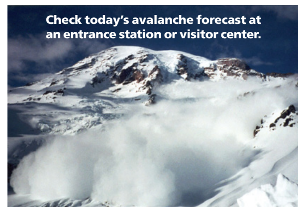
Check today's avalanche forecast at an entrance station or visitor center.