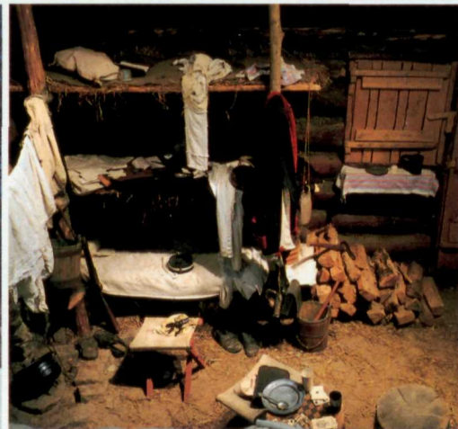
Soldier life exhibit, Jockey Hollow visitor center