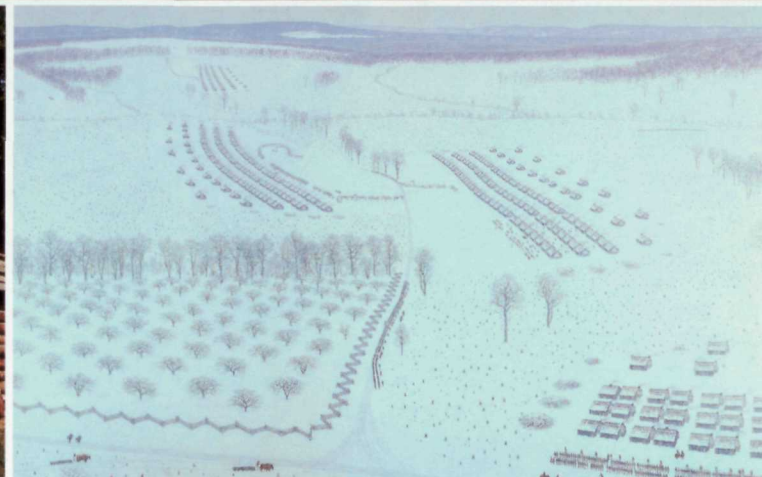
Detail from the troop encampment mural, Jockey Hollow visitor center