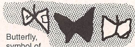
Butterfly, symbol of the Butterfly Clan

300 hundred years after their ancestors left, the farmers returned. They built homes of sandstone masonry or mud-packed sticks both on the mesa tops and in alcoves in the cliffs. South facing caves provided passive solar heat and cooling, thus saving on building materials. They often chose these sites near seep springs where water could be found. The last canyon dwellers left about A.D. 1270.