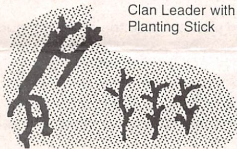
Clan Leader with Planting Stick

While hunters and gatherers may have passed this way earlier, settlement first occurred during this period. Corn was farmed, but wild plants and game made up more of the diet. The bow, arrows, and pottery were not made yet, but spears and baskets were. Homes were small slab lined “pithouses.”