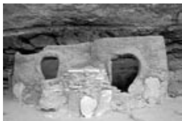
Horsecollar Ruin earns its name from the shape of the doors to these granaries.