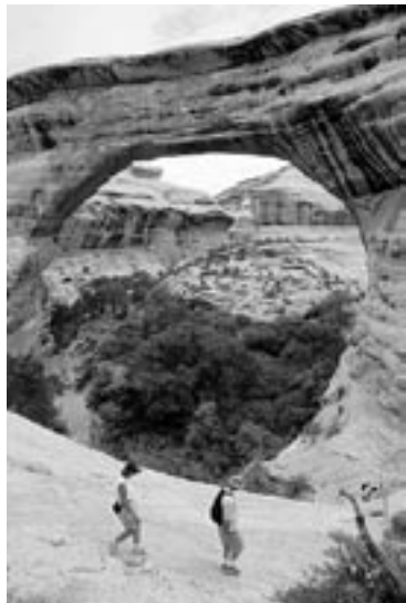
Hikers make their way down the trail to Sipapu Bridge.