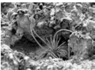
Cryptobiotic soil crust