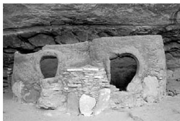
Horseshollar Ruin earns its name from the shape of the doors to these granaries.