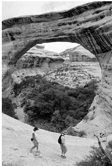
Hikers make their way down the trail to Sipapu Bridge.