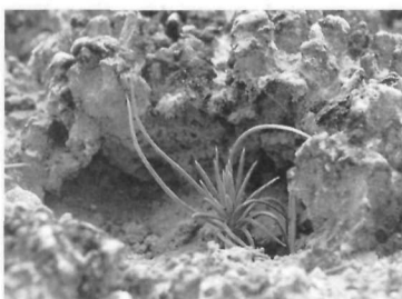
Cryptobiotic soil crust

Natural Bridges preserves habitat for a variety of plants and animals. Visitors may see mule deer browsing, hear the falling notes of a canyon wren, or smell the sweet aroma of spring wildflowers. To guard these experiences for future generations, please observe the following regulations: