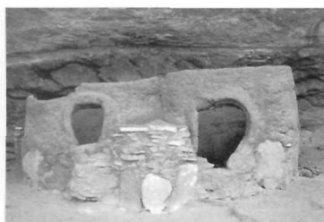
Horsecollar Ruin earns its name from the shape of the doors to these granaries.