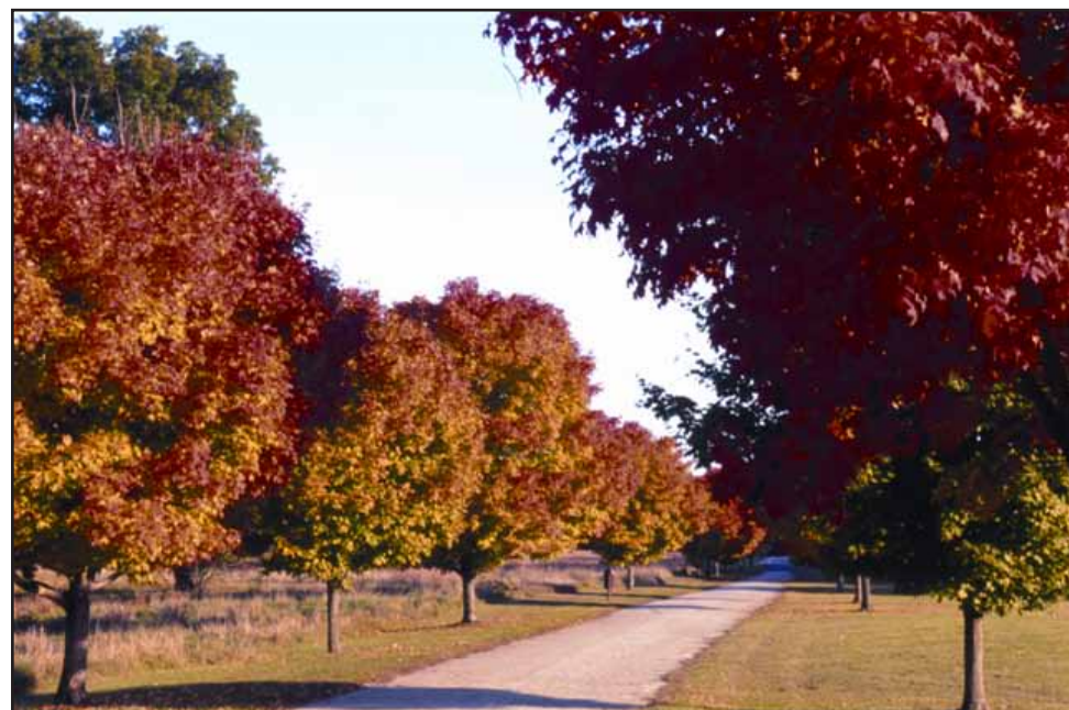
Fall Foliage in Piscataway Park.