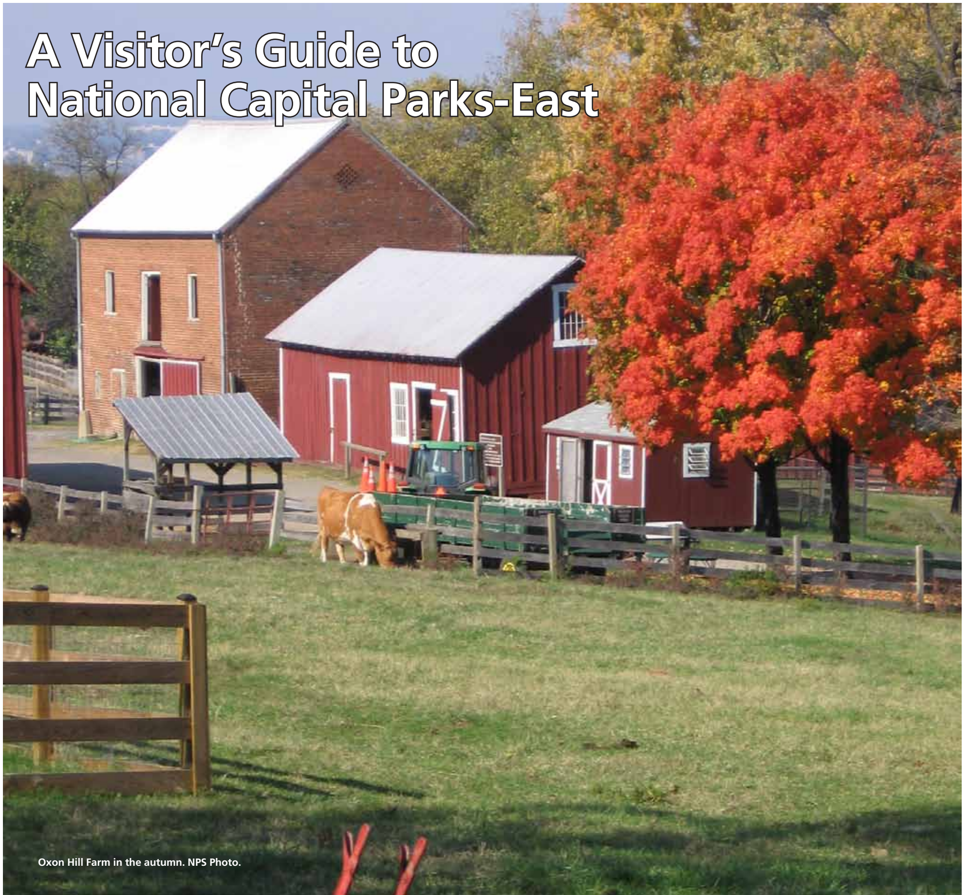
Oxon Hill Farm in the autumn.

Charting the Future while Preserving the Past.