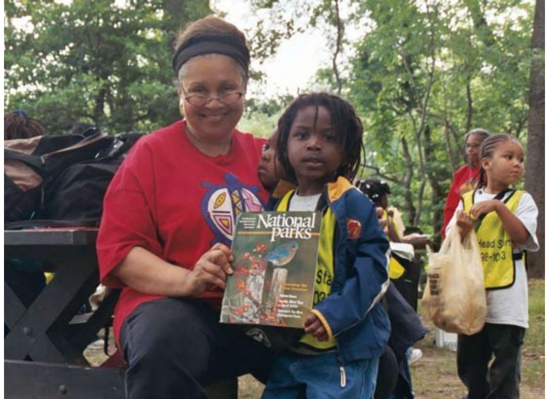
Earthday at Kenilworth Aquatic Gardens.