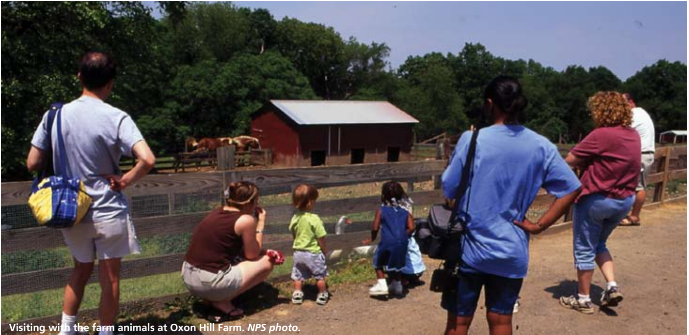
Visiting with the farm animals at Oxon Hill Farm.