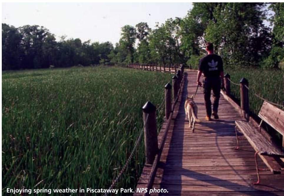
Enjoying spring weather in Piscataway Park.

Join us for a walk to discuss the history of Oxon Hill Farm.