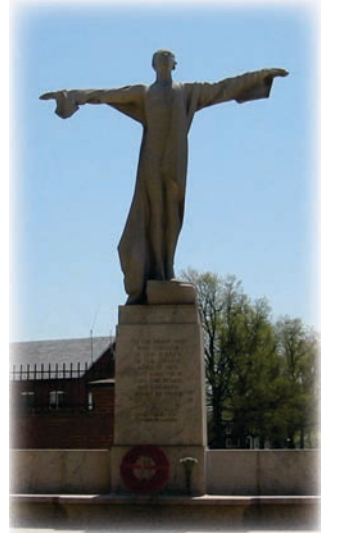
The Women's Titanic Memorial