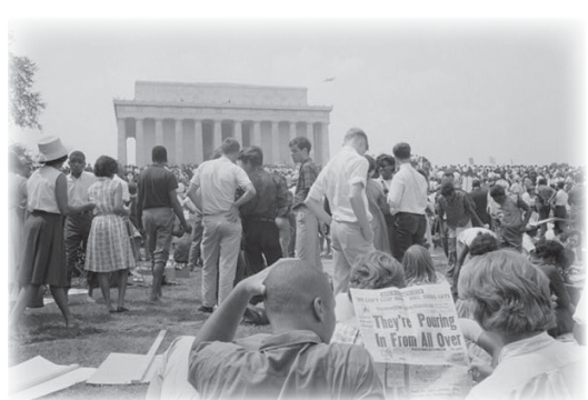
Crowds gather for Martin Luther King Jr. August, 28, 1963

An inscription on the steps marks where Martin Luther King Jr. followed to give his 1963 "I Have a Dream" speech. We can stand there in solidarity, looking to Washington Monument and the U.S. Capitol, site of the inauguration, backed