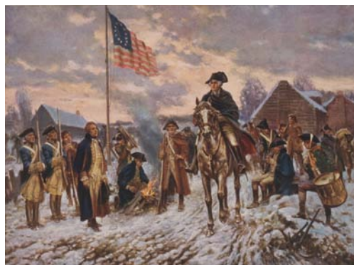
Washington reviews his troops at Valley Forge

Unfortunately, Americans were getting good and bad news at the same time. British troops were making landfall in New York as the Liberty Bell rang in Philadelphia. On July 9, 1776, General George Washington, while concentrating troops in New York City, ordered the Declaration of Independence read aloud to his troops. At that point, American and British forces had been engaged in armed conflict for fifteen months.