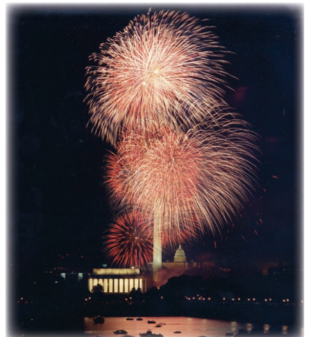
Independence Day Fireworks

As we celebrate our two-hundred and thirty-third birthday, the National Park Service will proudly carry on the words of John Adams— Bonfires and Illuminations from one End of this Continent to the other from this Time forward forever more —with a brilliant fireworks display. These illuminations will light up the sky of our nation's capital to to inspire and remind us of how fortunate we are to have the freedom that has been entrusted to us all.