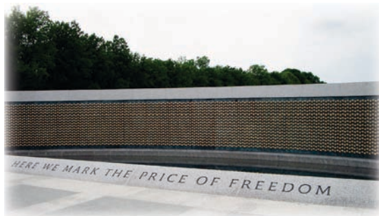
Wall of Gold Stars at the World War II Memorial

The struggle to keep the torch of freedom lit to this day can be seen as one walks through National Mall and Memorial Parks. Since the Revolutionary War, the United States has fought many wars to defend the torch of freedom; all have come at a terrible cost. Freedom rings as loudly today as it did at Independence Hall in Philadelphia on July 4, 1776, thanks to our determination as a nation and a people. This park is home to the memory of our nation's past, and we celebrate what Americans have achieved since the days of our founding fathers. It is here that we honor the sacrifice of those lost in defense of freedom.