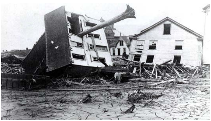
Flood damage in Johnstown, Pennsylvania

Perhaps the most gruesome of all the scenes at Johnstown occurred at the Pennsylvania Railroad