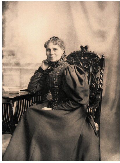
Clara Barton - 1897

Five days after the disaster, Clara Barton, age sixty seven, and a handful of volunteers arrived in Johnstown and began to manage the first major natural disaster to be overseen by the American Red Cross. She immediately began her work, using an abandoned railroad car as an office and employing a packing crate as a desk. Her previous experience on the battlefields was evident with the swift, deliberate, methodical way she handed out her orders. Hospital tents were immediately erected and eventually six hotels were built for the homeless and injured.