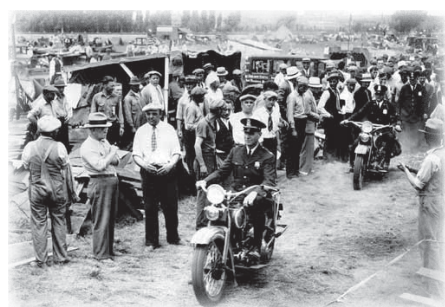
Chief of Police Pelham Glassford

Certificate. Created by Congress in 1924 and payable in 1945, this bonus was based upon $1.25 for every day served overseas, and $1.00 for every day served within the United States – totaling $2.4 billion. A bill introduced in Congress in the spring of 1932 would make the bonus payable immediately. Uncertain it would pass, a group of 300 veterans in Oregon organized a march on Washington, D.C. Within weeks similar groups organized and by May about 20,000 members of the Bonus Expeditionary Force (BEF) made their way to the capital.