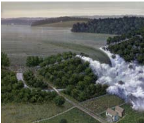
The South Fork Dam breaks!

Built on a flood plain at the fork of two rivers, Johnstown, Pennsylvania was an industrious steel town of 30,000 inhabitants. Fourteen miles upriver was the poorly maintained South Fork Dam. Residents nervously made fun of the fact that the dam could break at any moment, sweeping Johnstown away by a great flood. On May 31, 1889, following days of heavy rains, the dam burst. Twenty million tons of water rushed down the valley in the form of a wall of water nearly seventy-five feet high. The carnage was horrifying.