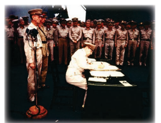
General Douglas MacArthur signs Japanese surrender instrument

A handful of pens were used by the general during this moment heavy with historical atmosphere. Behind the Supreme Commander