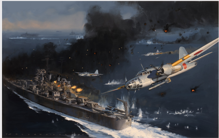
Ordeal of the USS Houston

as well as work in shipyards, dockyards, mines and industrial sites. Due to disease, malnutrition, and abuse, fewer than 300 of Houston's crew would survive their experience. Those who did were little more than walking skeletons. Like the rest of the WWII generation, they asked for little, if anything, upon their return home.