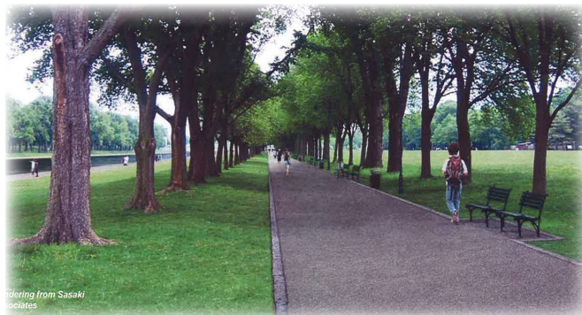
Proposed Elm Walk

Construction Projects continued on page 6