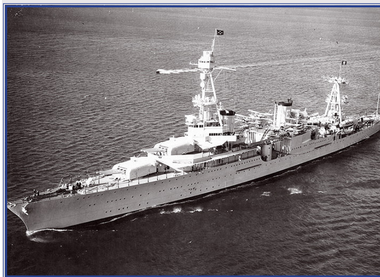
The USS Houston ca. 1930

In 1940, Houston returned to the Philippines to serve as flagship of the U.S. Asiatic Fleet once again,