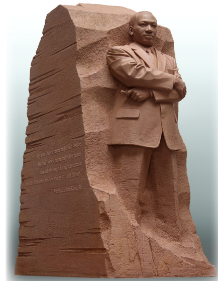
Stone of Hope Sculpture

Reconstruction of the Thomas Jefferson Memorial Seawall: This $12 million ARRA