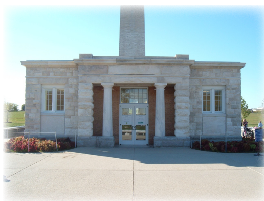
Washington Monument Lodge

Franklin Delano Roosevelt Memorial 9 a.m. - 5 p.m.