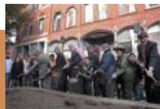
October 24, 2006 Ground breaking ceremonies for Corson Building rehabilitation project

Since 2005, Citizens Schools, in partnership with the New Bedford Public Schools, has introduced dozens of young people to park resources through its after-school apprenticeship program. Participants, some shown here in front of the Seamen's Bethel, served as Junior Interpreters during special events and worked with park staff to design a kid's activity booklet and a local history calendar.