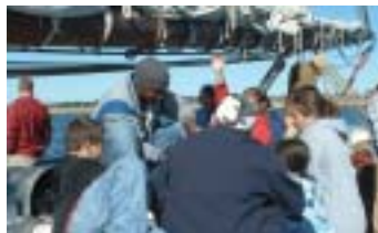
Middle school students test water samples while sailing onboard Schooner Ernestina . The National Historic Landmark schooner, built in 1894, is the park's link to the sea.