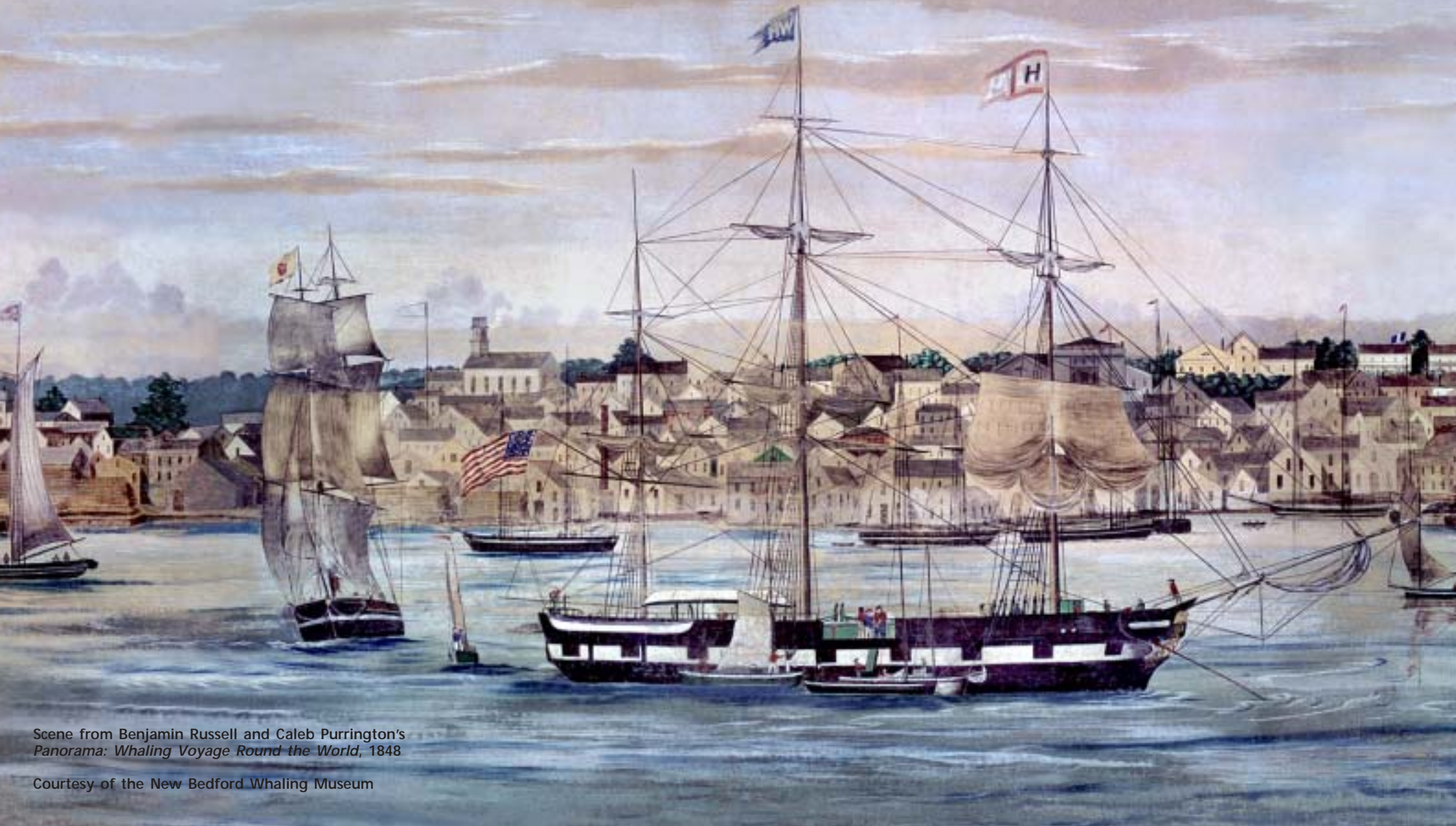
Scene from Benjamin Russell and Caleb Purrington's Panorama: Whaling Voyage Round the World, 1848