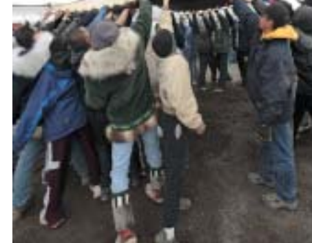
The blanket toss at Nalukataq festival in Barrow, Alaska