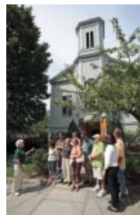
Park volunteers and rangers offer guided walking tours of the park in July and August.