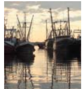
Fishing boats in New Bedford harbor