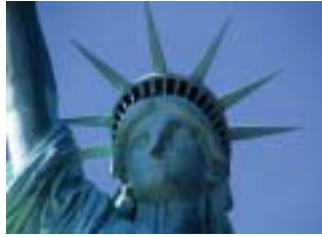
Statue of Liberty National Monument

Currently, there are 390 units in the National Park System. Experiences in national parks refresh our minds and recharge our spirits.