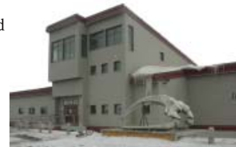
Inupiat Heritage Center in Barrow, Alaska