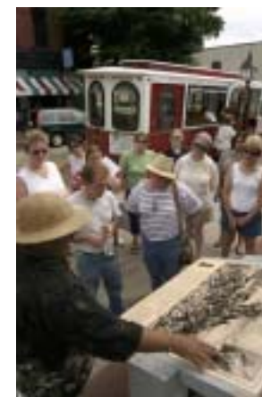
Portraits of a Port is one of several teacher institutes developed by the park and its partners.