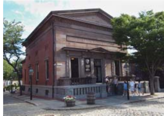
Park visitor center

If the story of whaling...is to be preserved and presented anywhere, New Bedford is the logical and most suitable location to do so.