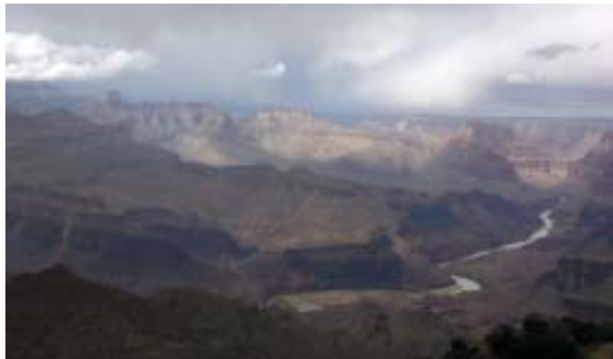
Grand Canyon National Park