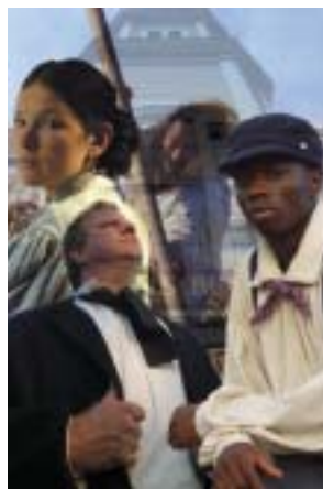
The City that Lit the World is the park's official orientation film and is the result of a collaborative effort by the park's partners.

Over the past 10 years, the park has collaborated with partners to develop and offer the public an accessible visitor center for park orientation, indoor exhibits, an orientation film, outdoor interpretive and wayfinding panels, maps and brochures, guided and self-guided walking tours, youth and educational programming, and public programs that showcase the cultural heritage of our vibrant community. These projects highlight some of the ways the park and its partners interpret New Bedford's shared whaling and maritime history.