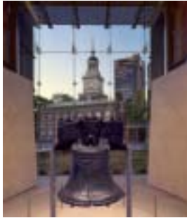
Independence National Historical Park

Parks like Yellowstone, Yosemite, and Grand Canyon showcase noteworthy natural systems and scenic splendor while places such as the Statue of Liberty, Independence Hall, and Boston National Historical Park represent people and events that helped shape this country's history and character.