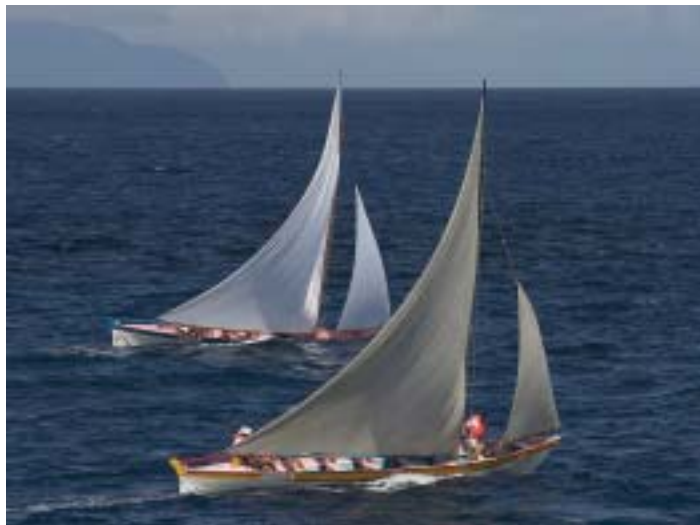
Park partners participated in the International Azorean Whaleboat Regatta in both New Bedford and the Azores.