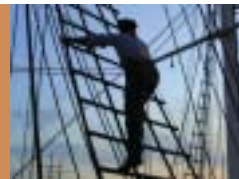
May 9, 2002 Premiere of park's orientation movie, The City that Lit the World

Park staff and partners travel to the Azores for the first of several visits that are part of a USDA sponsored program to foster educational and cultural ties