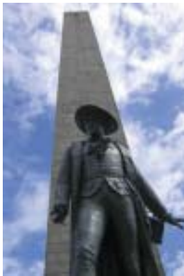
Boston National Historical Park