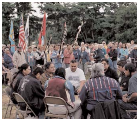
Nez Perce drummers at the opening ceremony of the Nez Perce Tribe's Summer of Peace signature event.

The bicentennial of the Lewis and Clark expedition returned to Nez Perce Country in June 5-17, 2006. The second time around, the spotlight was on the Nez Perce Tribe who hosted 'The Summer of Peace', a special event to commemorate the interactions between the Corps of Discovery and the Nez Perce people.