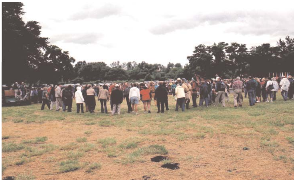
Over 1,200 people attended the opening of the Summer of Peace and participated in a circle dance at the ceremonies conclusion.

For more information, please call the park at (208) 843-7001.