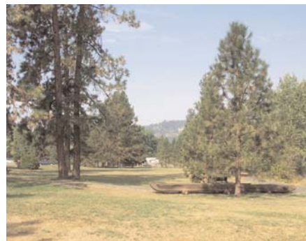
Canoe Camp now has a larger parking area, restrooms, and new trails.

The park's Canoe Camp site has reopened to visitors with expanded parking, pedestrian trails, new restrooms, and interpretive panels.