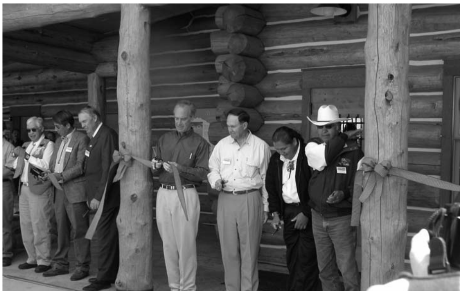
Governor Dirk Kempthorne (to the right of the pole) of Idaho assisting officials from the states of Idaho, Montana, the Nez Perce Tribe, and the Salish Kootenai Confederated Tribe join in cutting the ribbon for the new Lolo Pass Visitor Center and Rest Area.

Representatives from the Nez Perce Tribe, the Chief Joseph Band of Nez Perce on the Colville Reservation and the Confederated Salish Kootenai Tribe made remarks during the ceremony. For generations, the Nez