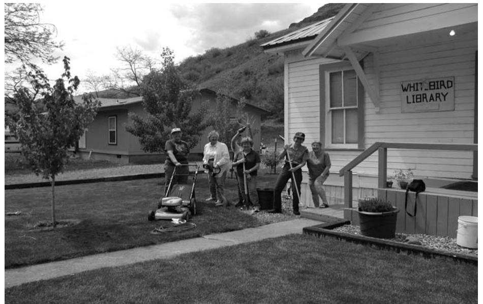
Volunteers from Whitebird, Idaho ready to go to work.