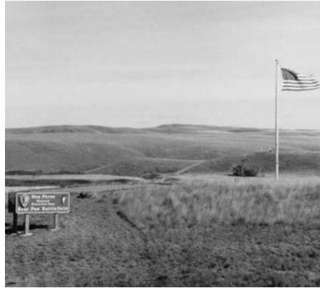
Bear Paw Battlefield

Visitation to Nez Perce National Historical Park and Big Hole National Battlefield rose during the summer months of 2003. In the