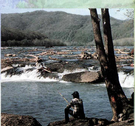
Fishing at Sandstone Falls

Anglers fish from banks, shallows, or boats. Climbers tackle the gorge's sandstone cliffs. Others explore scenic and historic areas by foot and mountain bike or from vehicles. You can picnic at the river level and near the rim. If you enjoy vigorous activities or just relaxing—New River Gorge is for you.