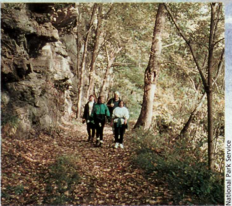
Hiking along Kaymoor Trail

Anglers fish from banks, shallows, or boats. Climbers tackle the gorge's sandstone cliffs. Others explore scenic and historic areas by foot and mountain bike or from vehicles. You can picnic at the river level and near the rim. If you enjoy vigorous activities or just relaxing—New River Gorge is for you.