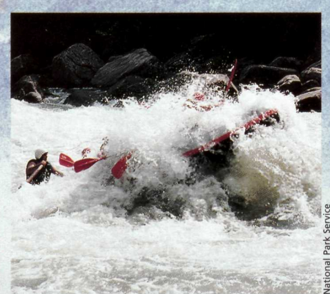
Whitewater rafting at Fayette Station