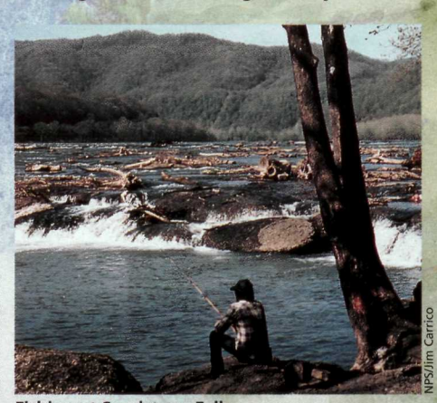
Fishing at Sandstone Falls