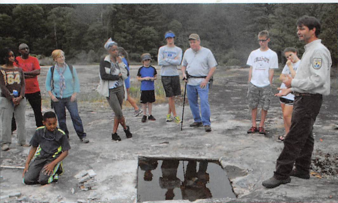
Above: Educational tours we offer to the public