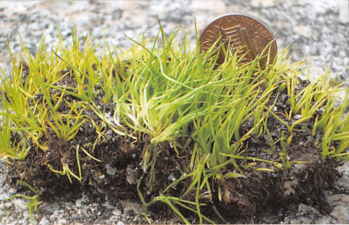
Above: Pool sprite ( Amphianthus pusillus )