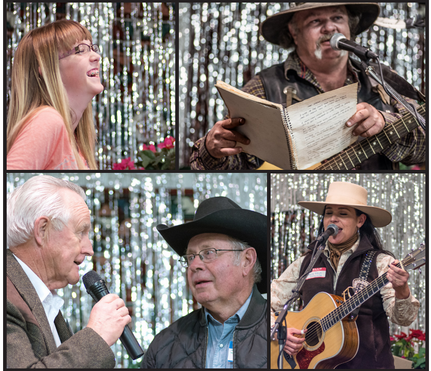
Poetry, story-telling, music, and a good amount of humor are all part of the program, which was sponsored this year by the Great Basin Heritage Area Partnership with support from the Nevada Arts Council and the National Endowment for the Arts.

Every January, shepherders and their families from across western Utah and eastern Nevada converge at the state line for a weekend of comradery. But the event is more than mere reminiscing: the Gathering is a venue for passing on history to younger generations and sharing a bit of sheep industry culture with the non-initiated. Friday's buffet dinner is for sheep folk, but the program Friday night, the Basque family-style dinner on Saturday, and all the Shepherders' Ball are open to the public.