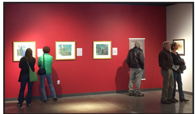
The Topaz Museum is now open daily from 1:00 - 5:00 (MST), except Sundays. Learn more at www.topazmuseum.org .

This art exhibition precedes the large-scale permanent Topaz Museum exhibition of history and artifacts that will open in