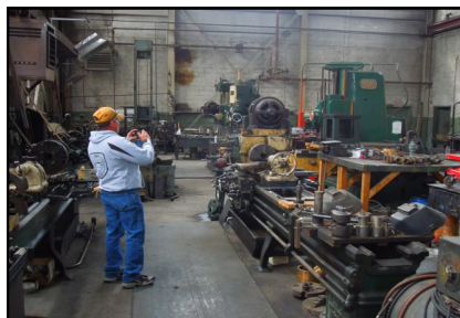
Northern Nevada Railway Shops