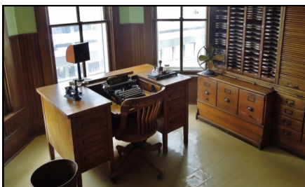
East Ely Depot Museum