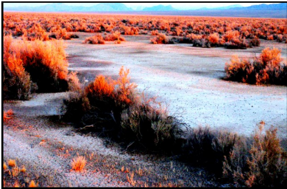
Along the highway in Utah's West Desert