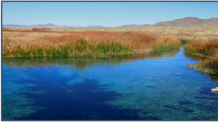
Big Warm Spring at the Duckwater Reservation helped inspire the film

Heritage Area: its archeological importance, its scenic beauty, its biological diversity, the importance of water, the culture of mining, ranching and the pursuit of recreation.