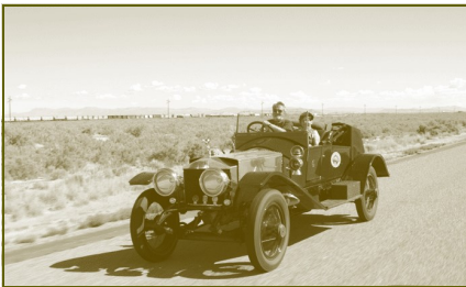
Crossing the Great Basin near Delta, UT in a 1913 Hume Carriage

Late in 1910, several potential investors visited the Leamington Canyon area to participate in the beginnings of a land and water development being planned. This project was a revival in an irrigation project started in 1895. In 1912 the Sevier Land and Water Company was planning to divert water to irrigate 6,000 acres of land. The company constructed a building in Lynndyl to serve as a land office and residence for local sales representatives. The expanding company stimulated a small land boom that lasted intermittently for a decade. The first farmers arrived in 1913 and drew lots for land, then registered proper government papers. They purchased water from the company. As a result of the land promotion by the Sevier Land and Water Company and the continued railroad roundhouse activity, the population of Lynndyl increased.