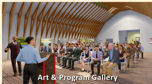
Art & Program Gallery