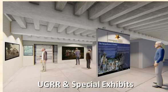
UGRR & Special Exhibits