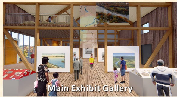
Main Exhibit Gallery