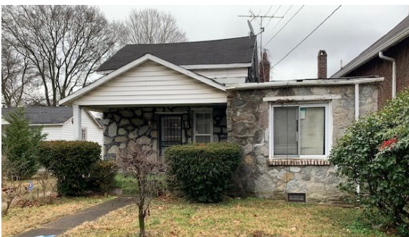
The "Green Book" House refers to a famous mid-20th century guidebook that African American travelers used to find safe places to lodge and eat in America. This property was the only Franklin business listed in the Green Book in the 1950s.

In Appalachia Tennessee, the Center has returned to assist local and state officials in the preservation and rebirth of the Tanner Center , a restored historic African American