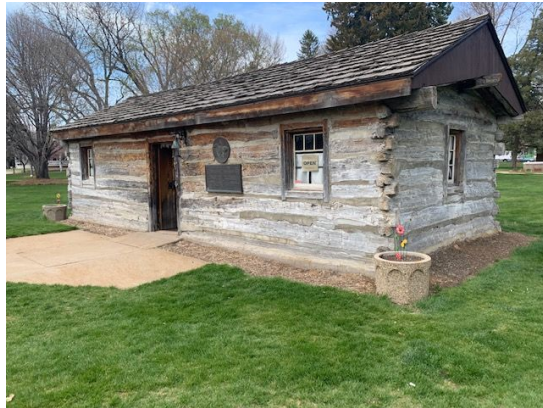
National Trails Historian Amy Kostine documents a portion of the trail in Nebraska, work which included a log cabin, later used by the Pony Express, in Gothenburg, Nebraska.