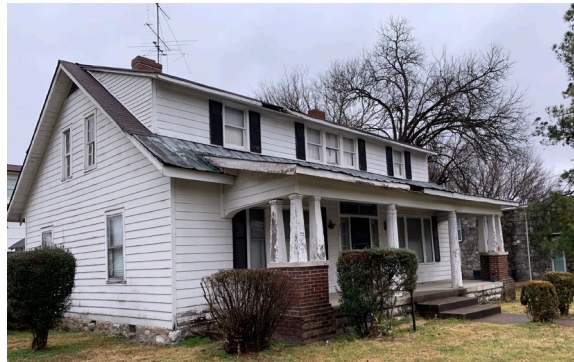
The signing ceremony for the Merrill-Williams House took place in April 2021.