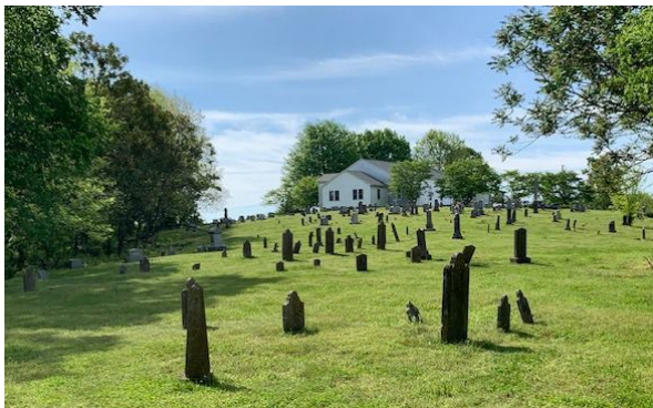
Mt. Nebo Cemetery, Maury County