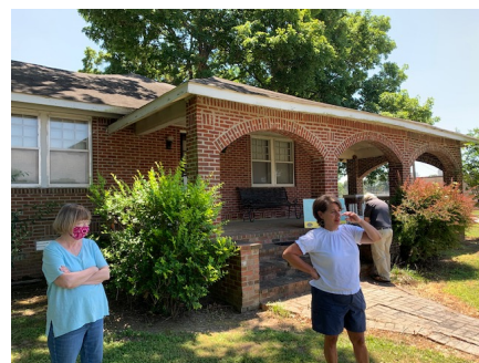
Haywood County Poor Farm meeting