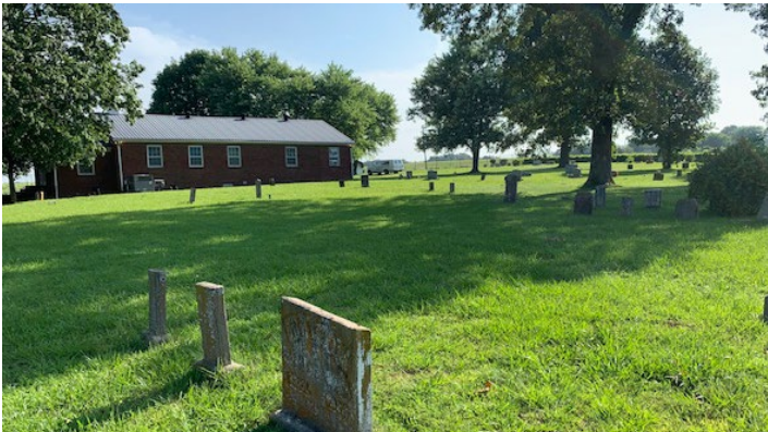
Parker's Chapel Baptist Church and Cemetery, Portland.