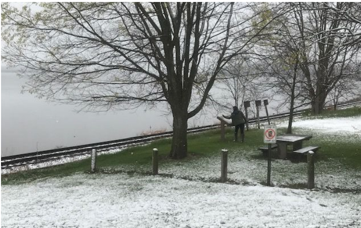
Fieldwork at a Mississippi River bank campsite in Iowa began on a snowy April day.