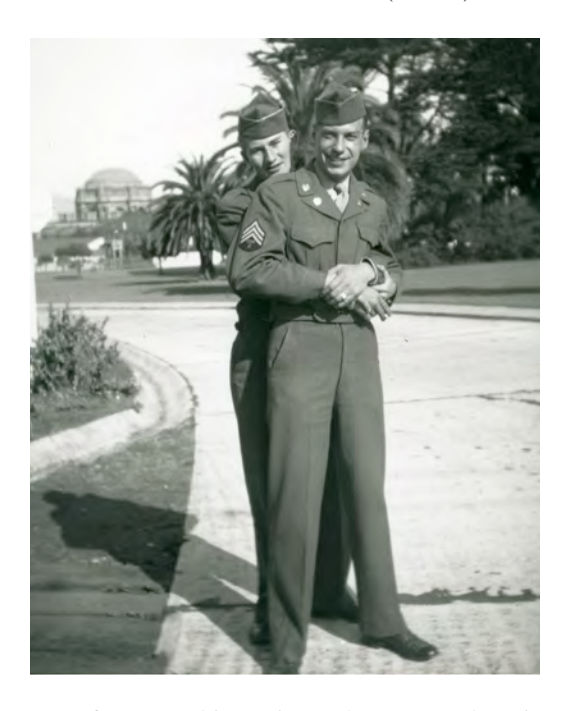
Figure 4.2 : Man, WWII. While it can be difficult —as indicated by the title of the photo above— to definitively point to some military relationships as queer,