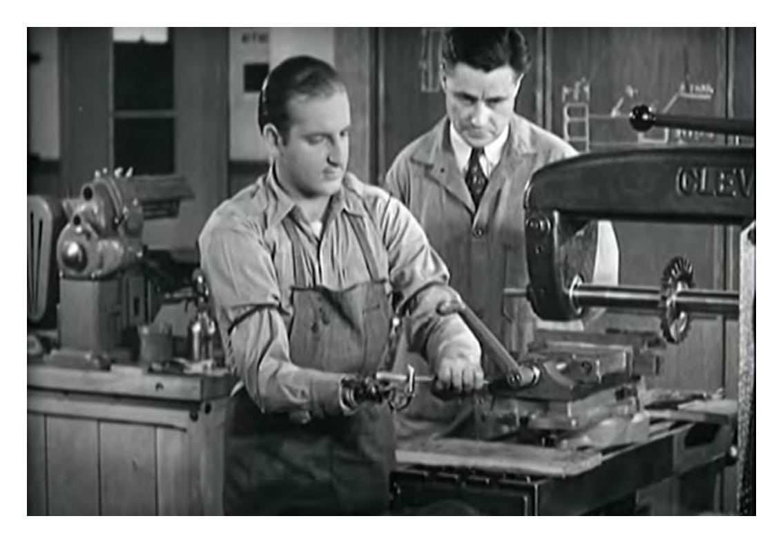
Figure 5.1 : Still of Worker With Prosthetic Receiving Training, from film "Employing Disabled Workers in Industry"

Finally, in March 1943, veterans' organizations and their allies triumphed. A separate veterans bill, Public Law 16, passed. The bill gave "disabled veterans the opportunity to receive special training to restore their employability." <sup>56</sup>