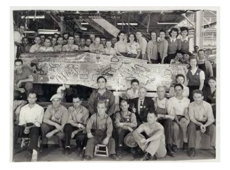
Figure 5.4 : Group of Workers Posing in front of Signed P51 Mustang Panel, North American Aviation Plant, Inglewood, California.

The AFPH and others involved in the fight for better disability programs echoed wartime gender discourse. In May 1942, Strachan, harnessing one of the potent wartime symbols, urged Congress "not only to save scrap, but save and utilize men and women who have been, are, or may be scrapped by reason of disability." His reference to disabled women was distinctive, but fit with the increasing calls to bring women into the wartime workforce. More often, though, Strachan spoke about the desire of disabled men to work. He often leveraged concerns about what would happen to male disabled veterans and connected the desire to find positions for disabled men to the manly mystique of organized labor and the ideology of male citizenship tied to work. After all, as Jennings writes, "wounded soldiers and injured workers had developed their disabilities in masculine pursuits, while they were protecting the nation and earning a living through honorable, productive labor." Making these links offered the AFPH "an opportunity to counter popular beliefs about disabled men as emasculated while offering a new construction of masculine disability." On the productive labor.