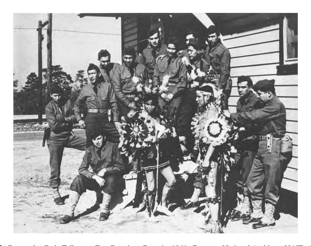
Figure 2.2: Comanche Code Talkers at Fort Benning, Georgia, 1941.

The contributions of the approximately 25,000 men and women who entered the U.S. Armed Services are the best-known part of World War II-era Native American history. Their story is dominated by a tiny percentage of Native soldiers: the Navajo code talkers. The limited comprehension of even this aspect of Native wartime experience represents the larger silences around military and, for that matter, civilian contributions. Not just the Diné, but Ojibwe, Absaroka (Crow), and soldiers from at least twelve other Native nations used their tribal language to defeat Axis code-breaking efforts and communicate in a language the enemy could not understand.<sup>28</sup>