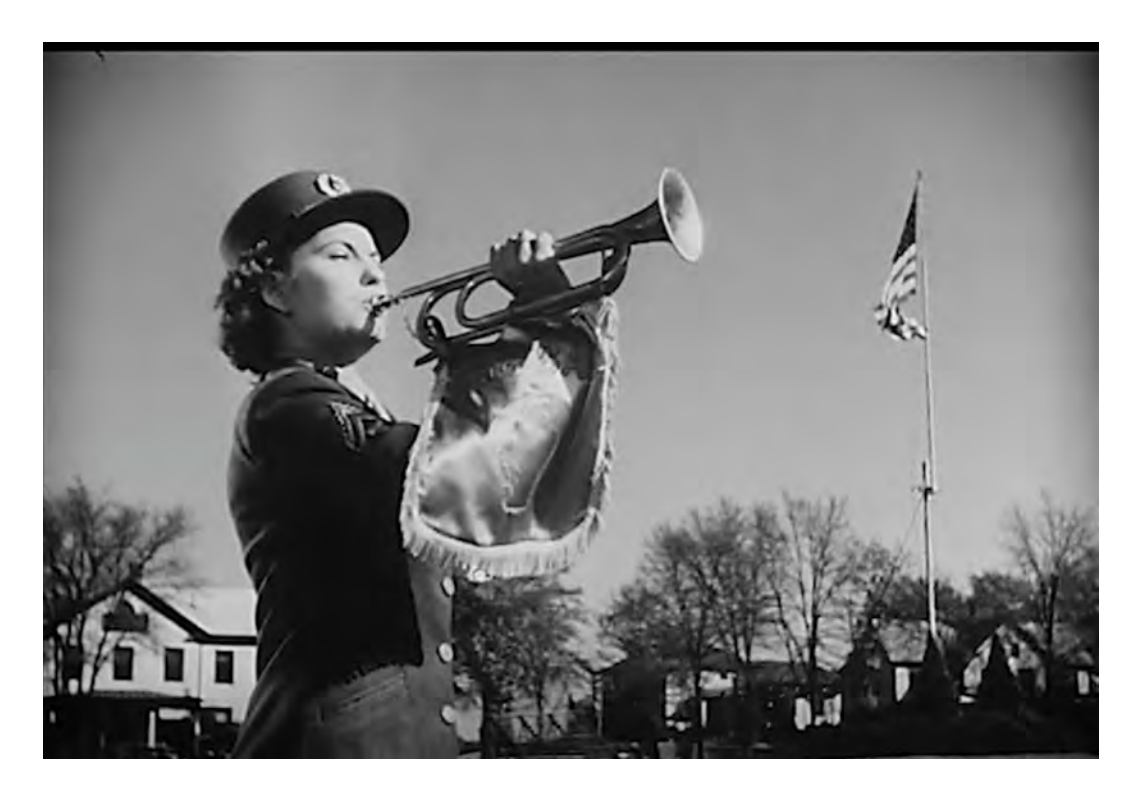
Figure 4.3 : Still of WAC bugler from It's Your War Too film, U.S. War Department, 1944. During WWII, Woman's Army Corp (WAC) bases such as Campe Oglethorpe in Georgia acted simultaneously as gathering points and sites of government investigations against lesbians.

Paralleling what occurred on other bases, butch women identified during the Fort Oglethorpe investigation had a good chance of being labeled "true homosexuals or addicts." Femme soldiers were more likely to be considered victims, led astray by butch partners. The psychiatrist also took into account whether this was a first offense and the power relations between women of different military ranks, social classes, and educational backgrounds. Ultimately, six women faced punishment. One lieutenant was forced to resign. The others were transferred to the WAC Training Center at Fort Des Moines, where they were "hospitalized . . . for psychiatric treatment . . . with a view to being either restored to duty or separated from the service, depending upon the results of the treatment." The investigation also led to the pursuit of other WACs who had a reputation for being lesbians but who had transferred to different bases. 40