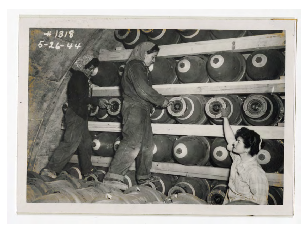
Figure 2.3 : Native American Women Working on 500 lb. Bombs at Navajo Ordnance Depot, Courtesy National Archives II, RG 156, Navajo Ordnance Depot, Basic History.

steel-reinforced concrete munitions bunkers, and 150 additional buildings, was one of the largest of its type—around the same size as Boston. Once the facility became operational, Hopi and Diné also filled many of the two thousand permanent positions required to operate the depot.<sup>73</sup>