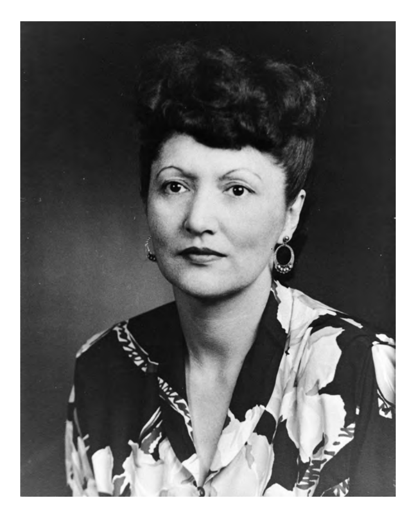
Figure 2.9: Portrait of Elizabeth Peratrovich, Alaska State Library, Alaska State Library Portrait File, ASL-P01-3294.

The legislation barred discrimination but failed to pass in the Alaska legislature in 1943. In the next legislative session in 1945, Peratrovich and other activists brought a large group of Alaska Natives to the territorial capital in Juneau to demand passage. They were supported by Governor Ernest Gruening, who cited the treatment of Schenck in backing the civil rights bill. Alan Shattuck, one of the White legislative leaders who opposed the anti-discrimination legislation, proclaimed on the state house floor that "the races should be kept further apart. Who are these people, barely out of savagery, who want to associate with us Whites with 5,000 years of recorded civilization behind us?" With those on the floor and in the galleries listening for her reply, Peratrovich gave a renowned speech in response calmly stating, "I would not have expected that I, who am barely out of savagery, would have to remind gentlemen with five thousand years of recorded civilization behind them of our Bill of Rights." Legislators and the public responded with raucous applause. 167