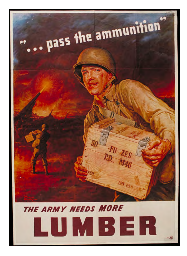
Figure 1.7 : Posters like this —titled "'... PASS THE AMMUNITION.' THE ARMY NEEDS MORE LUMBER"—reflected the ongoing need for resource extraction on the home front as part of the war effort.

Given this demand, conservation efforts largely fell by the wayside. The military pushed the USFS to allow an enormous number of acres, including previously untouched areas, to be clear cut. Suggestive of this, almost 2.5 billion board feet were cut from National Forests in 1943, an 83 percent increase from 1939. Companies, seeking to maximize profits and serve the nation's needs, cut new logging roads and found other ways to access public and private timber reserves, often with the assistance of the Forest Service personnel. Forest Service Chief Lyle F. Watts worried this increased demand for production had resulted in unwise choices that harmed the nation's forests. Richard Tucker concludes "the war expanded productive capacity exponentially; this new capacity would alter landscapes for decades to come." 134