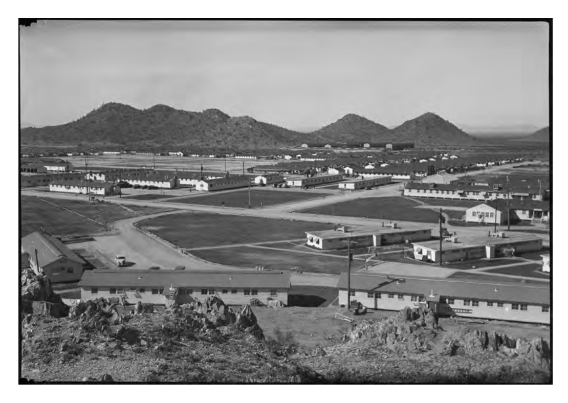
Figure 2.4 : Gila River Relocation Center, Rivers, Arizona. Butte Camp View. Courtesy National Archives NAID: 539550.

nations.<sup>115</sup> Neither tribe wanted the camp, which operated from May 1942 through November 1945 and housed thirteen thousand Japanese Americans at its peak. Defense and War Relocation Authority officials ignored objections from the tribes and the Indian Service.