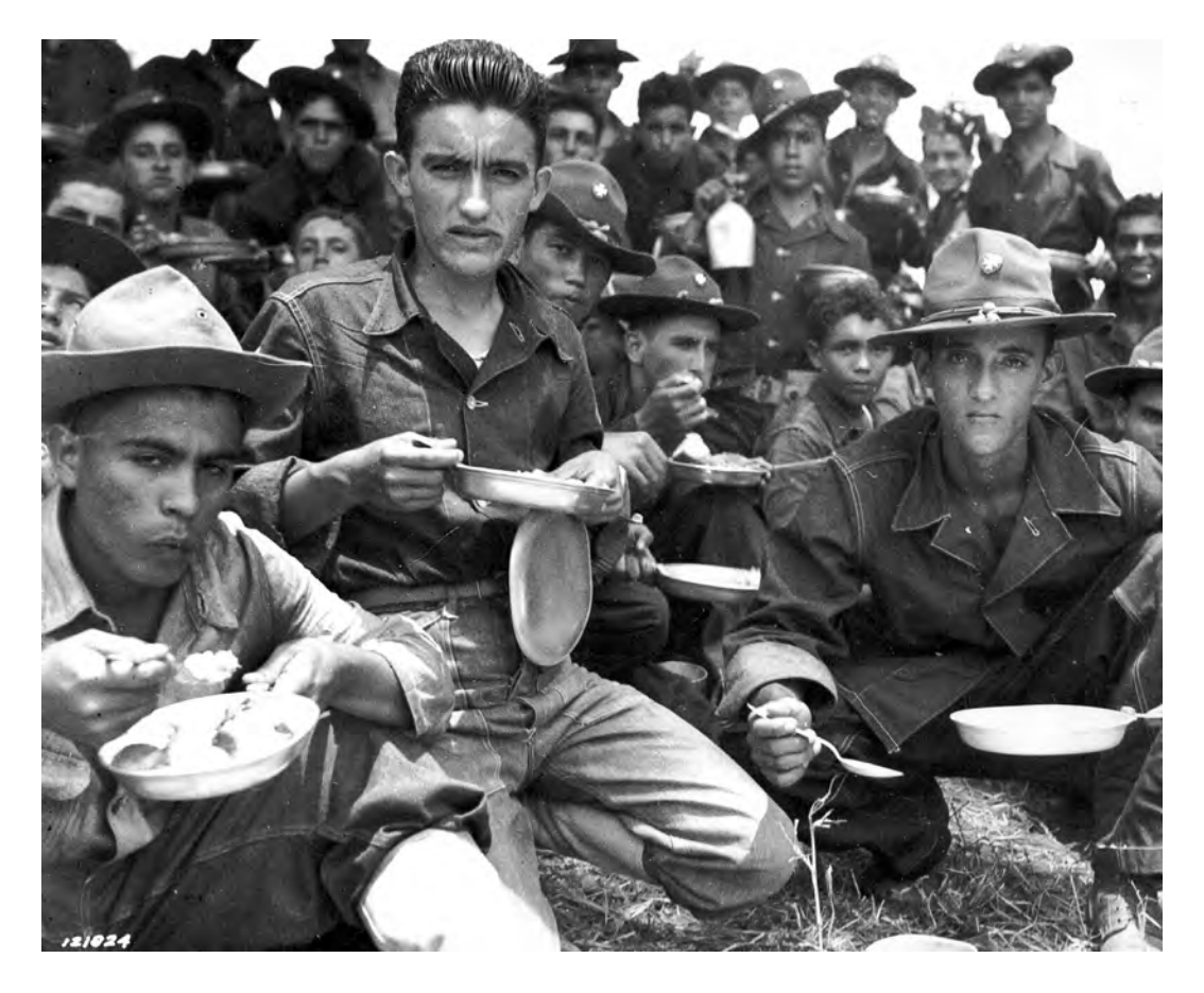
Figure 3.3 : Soldiers of the 65th Infantry training in Salinas, Puerto Rico. August 1941.

war.<sup>19</sup> They also suggest the ways the war remade race—creating new divisions and beginning to repair others—in the United States.