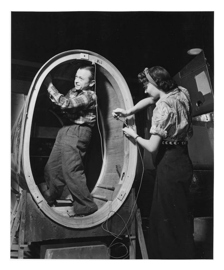
Figure 5.3 : "A [Little Person] and a woman worker install control wires on a "Valiant" basic trainer. At the Downey plant is made the BT-13A ("Valiant") basic trainer - a fast sturdy ship powered by a Pratt & Whitney engine."

The War Department's ordnance plants also hired disabled workers.<sup>97</sup>