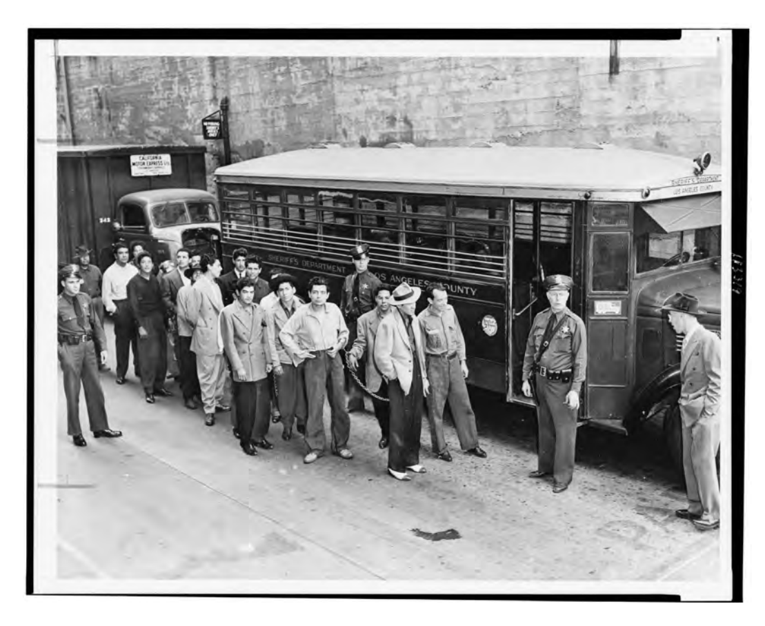
Figure 3.5 : Zoot suiters lined up outside Los Angeles jail en route to court during Zoot Suit Riots.

can American youth on public transportation, in theaters, and on the streets. They beat them, cut their hair, and stripped them of their zoot suits. The police typically looked on as this happened and then arrested the victims on charges of disturbing the peace.<sup>130</sup>