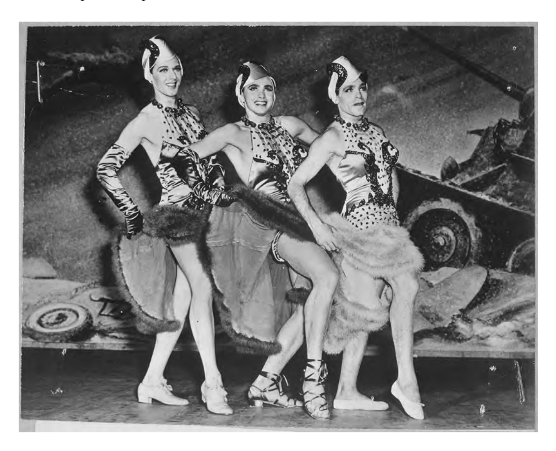
Figure 4.5 : Enlisted female impersonators performing in Irving Berlin's 1942 Broadway "This is the Army." Courtesy National Archives NAID: 535774.

queens "as heroines because of their overt and unabashed queerness." Some straight people also cheered "female impersonators." Because of their popularity, the government saw them as important to both civilian and military morale. Even military officials understood this, and protected performers from disparagement. For gay performers, the shows also created a support network and companionship. 112