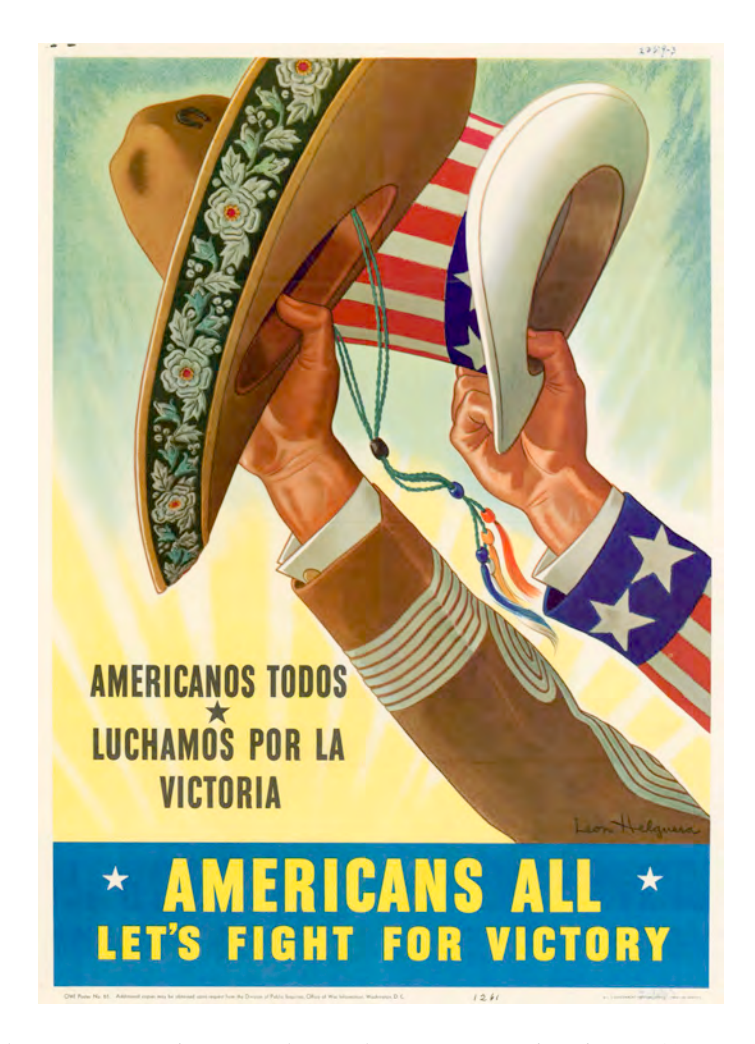
Figure 3.1 : Propaganda Poster "Americanos Todos Luchemos Por La Victoria," 1943. Leon Helguera, Courtesy of National Archives NAID: 513803.

New tensions also came into play with the community increasingly fracturing, especially along generational lines, over how to fight prejudice and racism and whether to assimilate. White supremacist practices on the home front and the circumscribed nature of new opportunities limited coalition politics, as illustrated by the relationship among different groups within the larger Latino polity and the perception of the potential economic threat of wartime contract workers from Mexico called braceros.