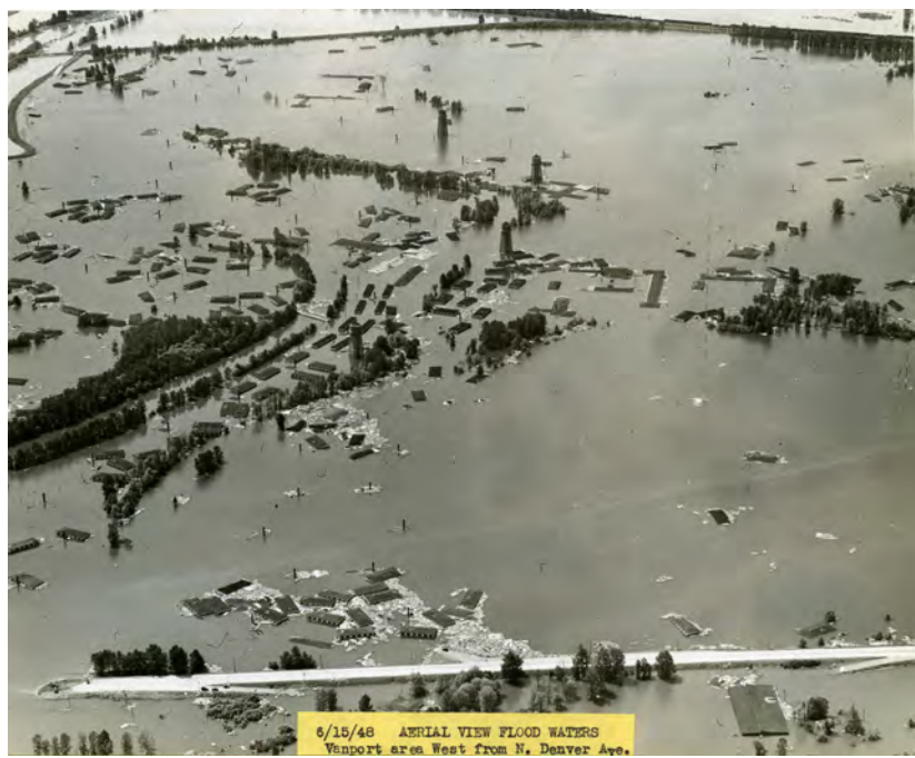
Figures 1.4 and 1.5 : Aerial images of Vanport, Oregon housing project before (above) and after (below) flooding in 1948.

While housing segregation, especially "redlining" and "racial covenants," is strongly associated with postwar suburbs, the crowded and substandard home front residential areas around war