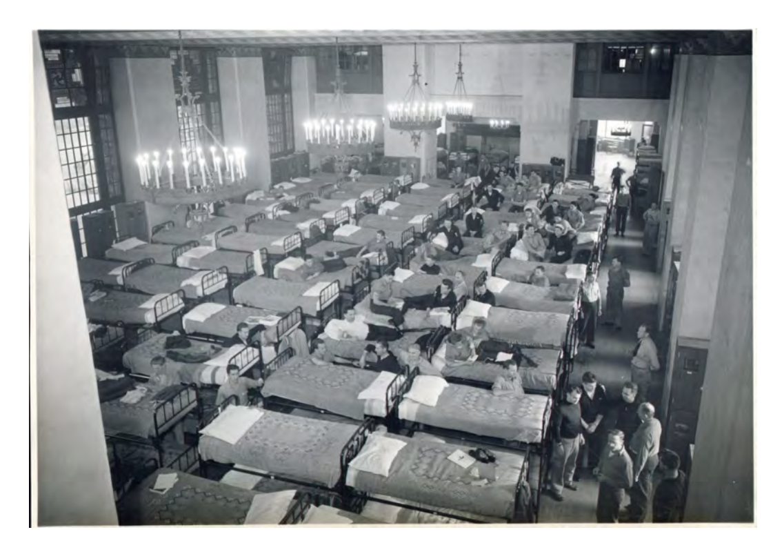
Figure 5.5 : "U.S. Naval A Ward," Ahwahnee Hotel in Yosemite National Park, 1943.

By the middle of the war, many new military medical facilities focused on specific aspects of rehabilitation. Valley Forge, for instance, was one of two hospitals, along with Letterman Hospital in San Francisco, that specialized in treating ocular injuries. Three dentists posted at Valley Forge in 1945 created a new acrylic artificial eye that was much more durable than the old glass eye prosthetics. <sup>129</sup> Other specialized facilities included the Marine Corps' treatment center in Klamath Falls, Oregon, designed to rehabilitate marines who caught tropical diseases in the Pacific. <sup>130</sup> Madigan Army Hospital in Tacoma, Washington, specialized in psychological disturbance and grievously wounded veterans. <sup>131</sup> Birmingham General Hospital in Van Nuys, California, opened a specialized spinal cord injury center in 1945, utilizing the holistic multidisciplinary approach that Dr. Ernest Bors pioneered. <sup>132</sup> The hospital also received acclaim for modifying cars for paraplegics and for creating a wing for female veterans. <sup>133</sup> Birmingham General Hospital proved influen-