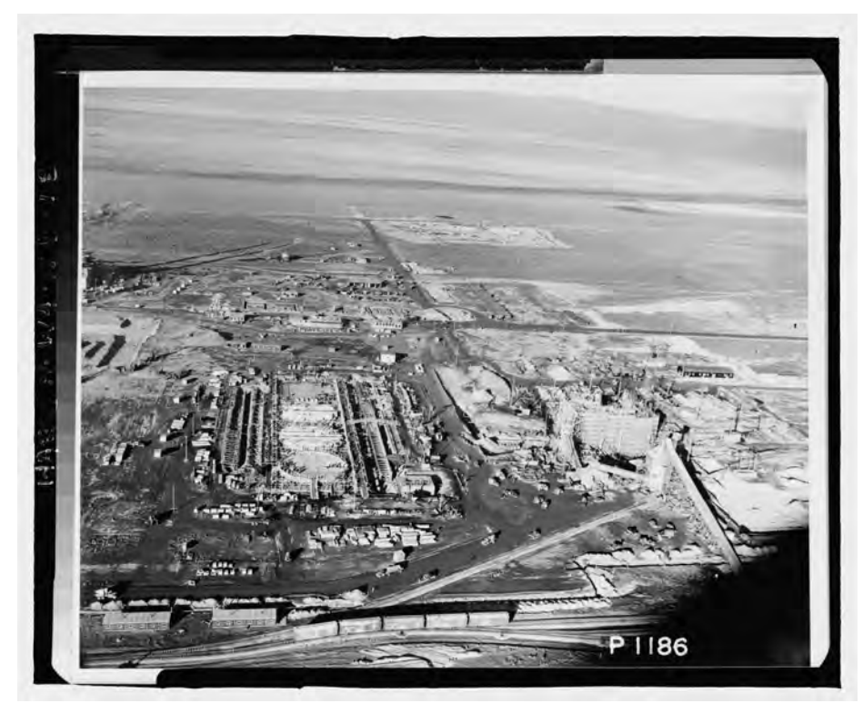
Figure 1.3 : Aerial view of the 100-B Area of the Hanford Site under construction in January 1944, Richland, Washington.

The isolation of the site and secrecy of the project meant managers at Hanford could sequester workers. This created what Brown calls "a zone of immunity," allowing a virtually unlimited ability to pollute. 60 She summarizes the results in communities in the U.S. and Soviet Union that paralleled Hanford: "The plants left behind hundreds of square miles of uninhabitable territory, contaminated rivers, soiled fields and forests, and thousands of people claiming to be sick from the plants' radioactive effluence."61