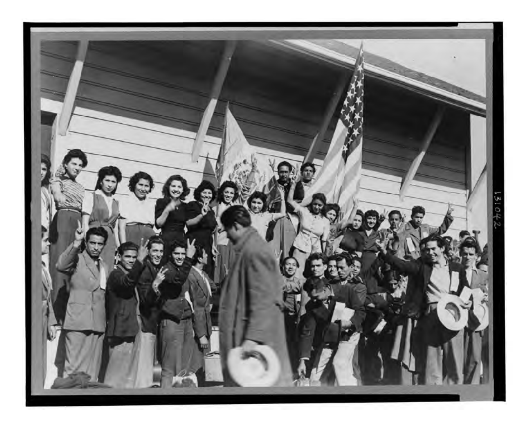
Figure 3.6 : Braceros arriving in Stockton, California, for beet harvest, May 1943.

A similar pattern occurred in Stockton, Sacramento, and in the Salinas Valley of California, as Sifuentez and Mitchell's research shows. <sup>188</sup> At the end of September 1942, the first train load of braceros arrived in Stockton and Sacramento to process sugar beets. Their contract, guaranteed by the FSA, stipulated they would "receive the same wages as those paid to other workers in the area of employment for similar work." <sup>189</sup>