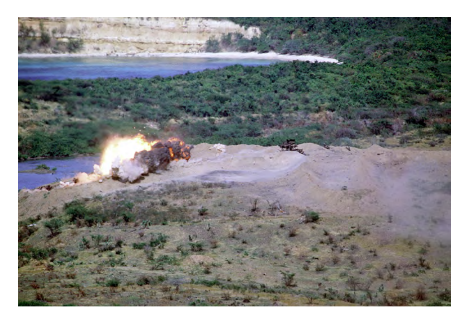
Figure 1.2 : This explosion on Vieques Bombing Range, photographed in 1988, reflects the continuing environmental impacts of the site.

Over sixty percent of Vieques was transferred to the navy without consulting its inhabitants who relied on subsistence agriculture to feed their families while also working for the sugar industry, which controlled most of the arable land. When the military acquired the land, sugar industry jobs disappeared. The military relocated Vieques residents to the center of the island where they lived crowded together in difficult conditions. The navy allotted them plots of land that were far too small to continue their agricultural practices, prompting virtually all to work in the wage economy that supported constructing and maintaining new military facilities. A marine base, ammunition depot, and navy support buildings occupied a considerable part of the remainder of the island. The navy turned the largest swath—the eastern sector—into a massive bombing range used for target practice from the air, ground, and sea and for large-scale maneuvers. When the U.S. was not using the bombing range, the government allowed other countries to rent it. The ecological damage to Vieques' caused by exploded and unexploded munitions and to surrounding waters, represented by the death of whales and dolphins, was profound.<sup>50</sup>