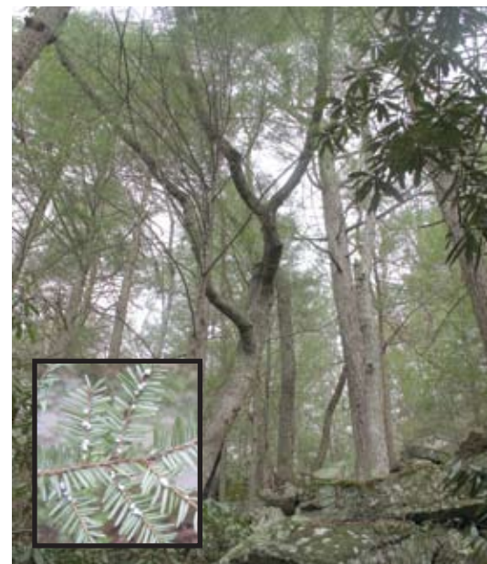
The deep shade of a hemlock canopy. Inset: Hemlock Woolly Adelgid.

Many of us have listened to our grandparents talk about the great chestnut blight that devastated the American chestnut tree population during the early 1900s. This blight almost completely eliminated a majestic species of tree that was once a dominate feature of the landscape.