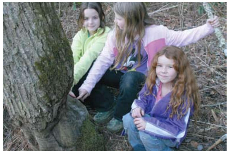
These girls are park neighbors and junior rangers. Obed programs help children connect to their park. Here, they discover a tree that has been gnawed upon by a beaver.

The relationship between the Park Service and the local community continues to improve significantly. Increasingly, large areas of privately owned, forested lands are being developed or posted as off-limits to the general public. As civilization continues to encroach on this nation's wild places, people begin to have a greater appreciation for the fact that public ownership preserves their ability to enjoy the land that they love. In a similar way, the regrettable degradation of lands and waters that were once pristine helps to underscore the critical importance of the park's mission of ensuring that the rivers known by local residents' grandparents will be the same rivers known by their grandchildren. School programs are vital to our progress in this area, helping children to recognize how special it is to have a national park in their backyard. We want them to know that this is their national park, preserved and protected for them to enjoy.