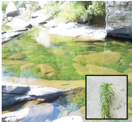
Hydrilla mats. Inset: Single hydrilla stem.

Hydrilla is currently present in Daddy's Creek, in the Obed River below its confluence with Daddy's Creek, and in the