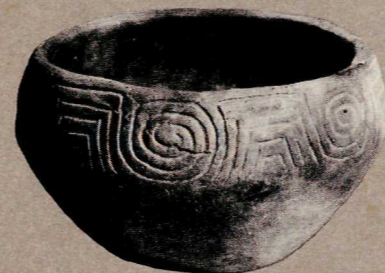
This bowl with designs incised on its sloping shoulders is typical of the Lamar Period.

At least some of these people were the direct ancestors of the Creek Indians who held most of Georgia and parts of Alabama in early historic times, and who were to play a vital role in the last pages of the Indian story in the East.