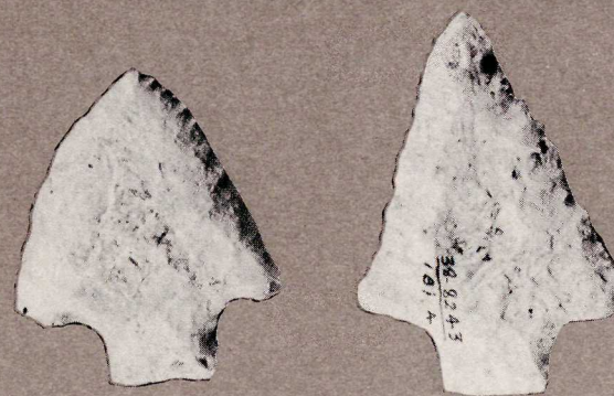
Stone dart points used by hunters living at Ocmulgee about 2,000 years ago.

Along the seacoast and lower reaches of the rivers, the Indians relied more heavily on the resources of the waters. Eventually some of these Indians or their ideas spread up the Ocmulgee River as far as this site. Here they found shellfish and such fish as shad and sturgeon, which they had known from their life on the seacoast. The plants and animals of the land supplemented the bounty of the river. Sometime before 2000 B.C., Indians along the coasts of Georgia and Florida began to make pottery, and this idea also spread inland to Ocmulgee. But even with these additions the people remained hunters and gatherers.