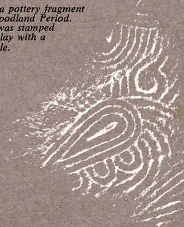
Rubbing of a pottery fragment from the Woodland Period. The design was stamped on the wet clay with a carved paddle.

During this time the custom of burial beneath rounded earthen mounds spread widely through the eastern United States. In some places this burial cult reached elaborate heights, with quantities of ceremonial goods placed with the dead; in this part of Georgia, however, the practice was carried on at a simpler level. Burial mounds do occur in this general area, but none of them were built by these people within the present extent of Ocmulgee National Monument.