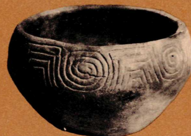
This bowl with designs incised on its sloping shoulders is typical of the Lamar Period.

At least some of these people were the direct ancestors of the Creek Indians who held most of Georgia and parts of Alabama in early historic times, and who were to play a vital role in the last pages of the Indian story in the East.