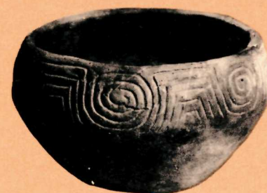
This bowl with designs incised on its sloping shoulders is typical of the Lamar Period.

At least some of these people were the direct ancestors of the Creek Indians who held most of Georgia and parts of Alabama in early historic times, and who were to play a vital role in the last pages of the Indian story in the East.