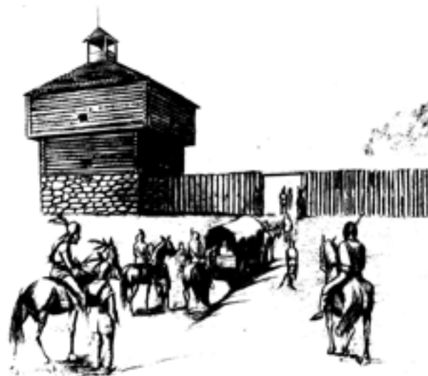
(CREEK INDIANS LEAVING FORT HAWKINS)

gathered to receive annuities from the government. Each U.S. treaty provided payment of such annuities in return for ceding the ownership of Indian land. By 1818, Anglo-Americans began settling on the lands around the fort. A ferry was built across the river. Within three years, the settlement name was changed from Fort Hawkins to "Newtown". In 1821, the Creeks signed a treaty giving up their lands between the Ocmulgee and Flint Rivers, and shortly afterwards the city of Macon was laid out on the west side of the Ocmulgee River. In 1826, the Ocmulgee Old Fields, the land on which Fort Hawkins sat, was also ceded along with all remaining Creek land within the boundaries of Georgia.