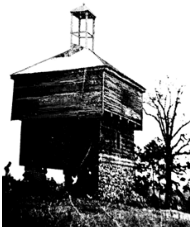
(BLOCKHOUSE IN 1879)

the original wood timbers. During the reconstruction, archaeology conducted at the site revealed the location and extent of the stockade walls and corner blockhouses. The excavations uncovered many everyday items used by the fort's inhabitants. The City of Macon currently maintains the structure and it is occasionally opened to the public.