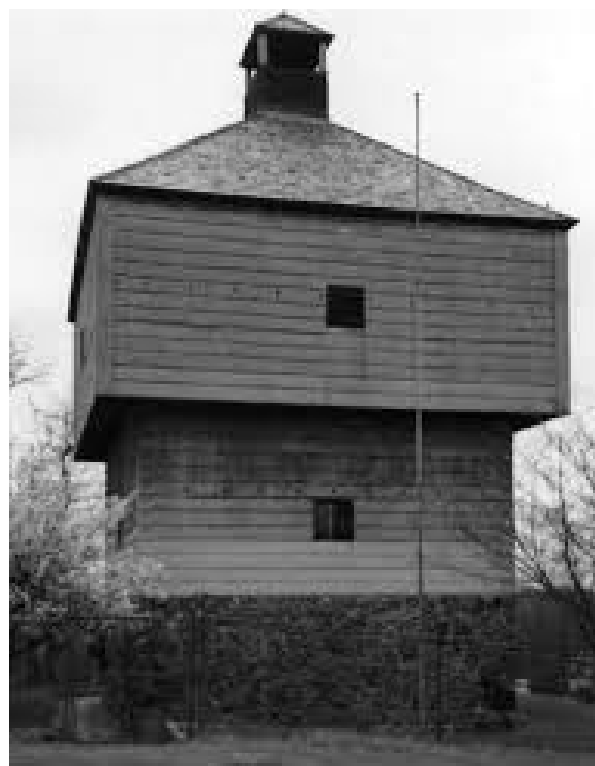
(BLOCKHOUSE IN 2020)