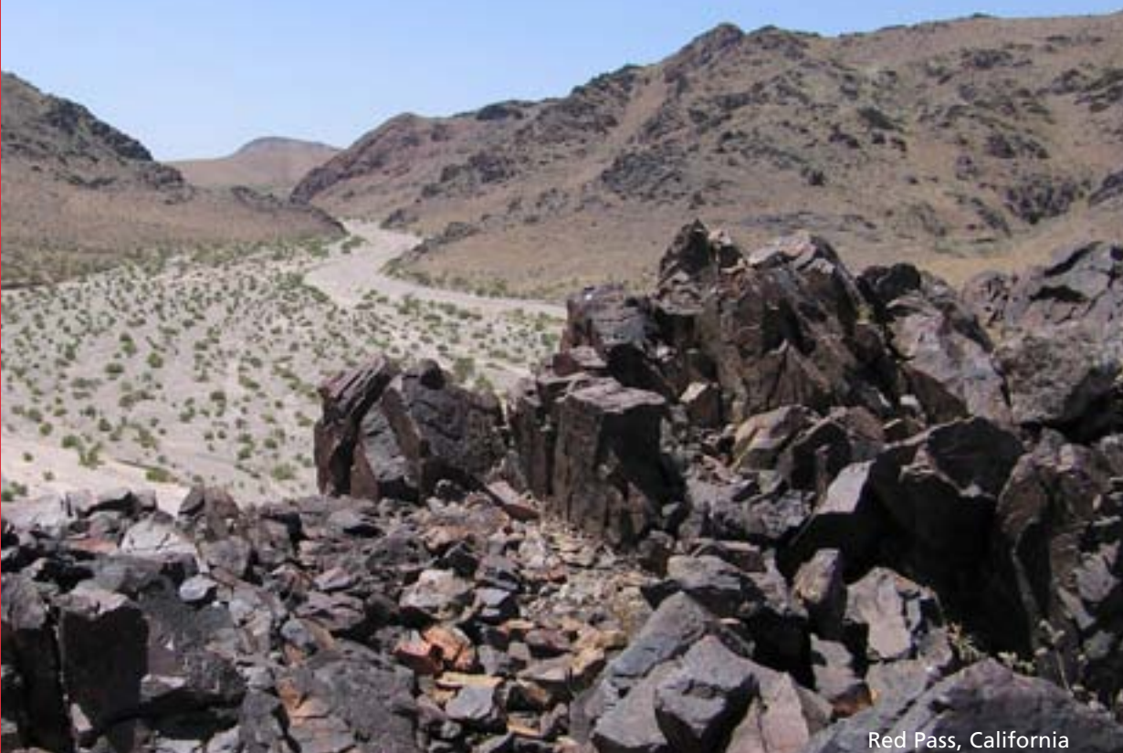
Red Pass, California

By this time Santa Fe is witnessing increased economic activity brought on by successful American and Mexican trade. Large quantities of manufactured products arrive in New Mexico from the eastern United States along the Santa Fe Trail. Many goods are also traveling along El Camino Real de Tierra Adentro to and from the interior of Mexico.