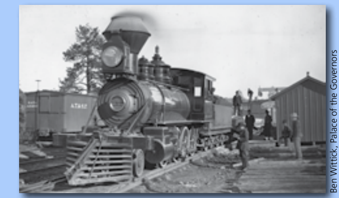
Ben Wittick, "Palace of the Governors Photo Archives (NMHM/DCA), 015870