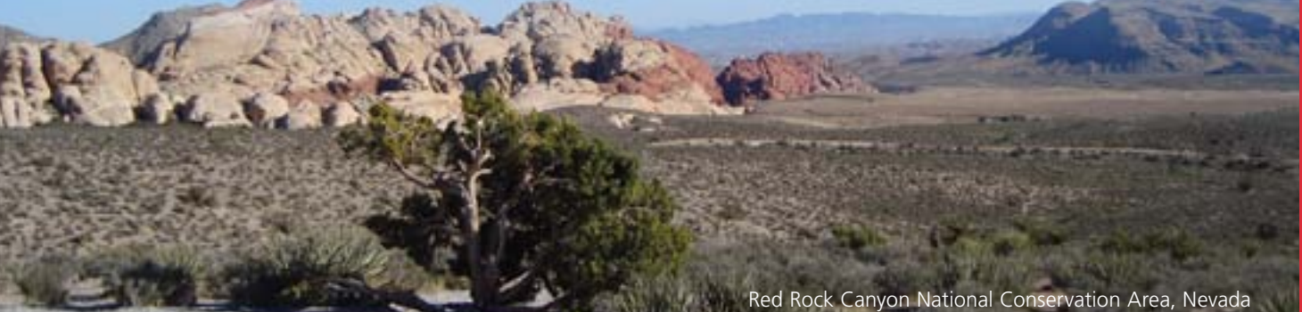
Red Rock Canyon National Conservation Area, Nevada

By 1869, however, a rail route connected the plains of the Midwest and San Francisco Bay. Portions of the Old Spanish Trail evolved into wagon roads for local travel, but the days of cross-country mule caravans on the Old Spanish Trail had ended.