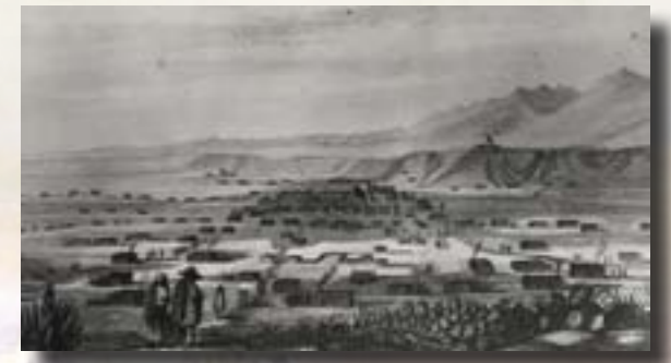
View of Santa Fe in 1846 by John W. Abert