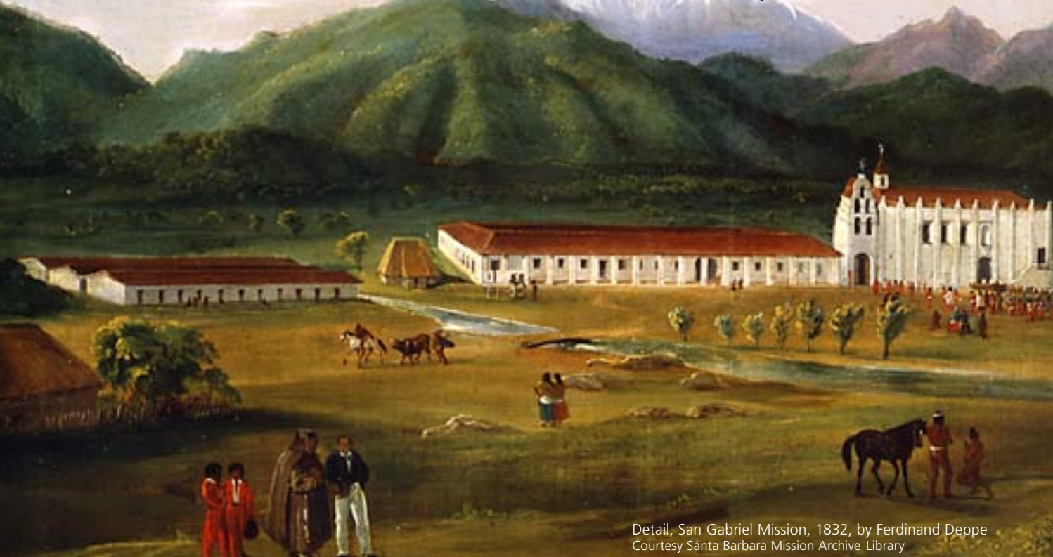
Detail, San Gabriel Mission, 1832