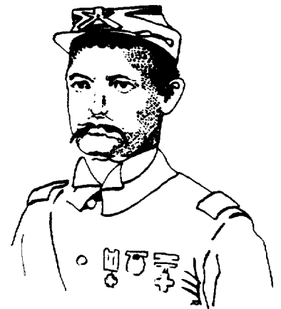
Lt. Joseph P. O'Neil

The fame of being the first Euro-Americans to cross the Olympics went to the 1889-90 Press Party. Financed by the Seattle Press , the well-publicized expedition crossed via the Elwha and Quinault Valleys, a six-month ordeal during one of the worst winters in history. A month after the Press Party emerged from the mountains, Lt. O'Neil began his second expedition. He and his men explored the eastern and southern Olympics between Hood Canal and the Pacific. The area inspired him to advocate establishment of a national park.