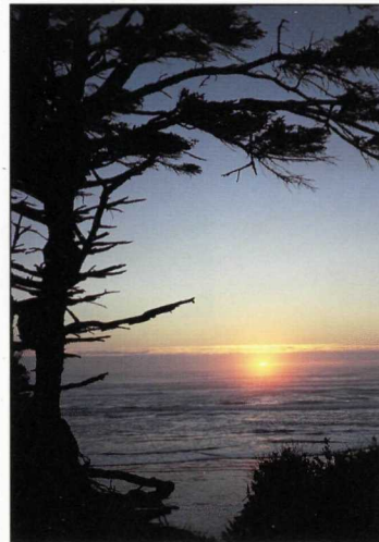
Watch Mother Nature in all her glory - from breathtaking sunsets to dazzling winter storms.

The serenity is energizing - the majestic nature scenes are captivating.