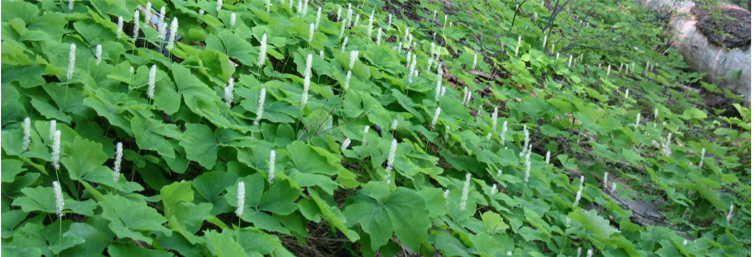
Vanilla Leaf in bloom at Oregon Caves National Monument