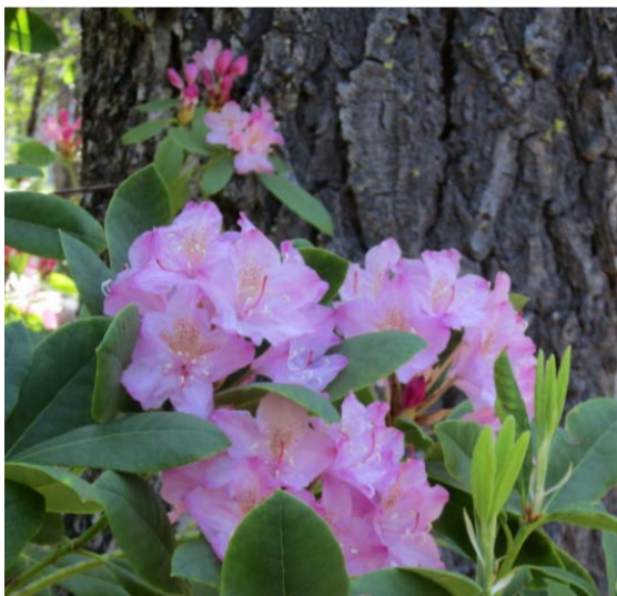
Rhododendron on Old Growth Trail

One of the most spectacular sights of early summer is the blooming of the Pacific Rhododendron. "Rhododendron" means "rose tree," and this shrub is well named, for its large clusters of flowers range in color from pale pink to red. These colors are striking against the dark green of the conifers the rhododendrons grow among.