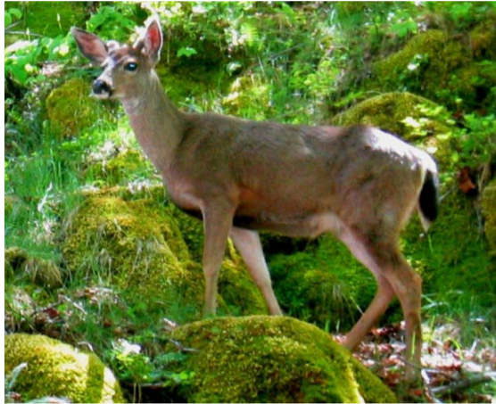
Columbian Black-tailed Deer

Resident black-tailed deer and their newborn fawns are easy to see this time of year on both Highway 46 and the trails at Oregon Caves National Monument. Mother deer are selecting isolated spots for labor and then leading their babies to new nursery spaces, such as the steep slopes of Highway 46, to avoid some predators.