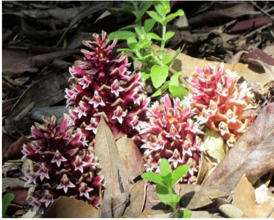
Ground Cones on Old Growth Trail

If you're walking along the Old Growth Trail and see what looks like big pine cones stuck into the ground, take another look. What you're seeing is actually the California Ground Cone, a wildflower. The "cones" are 3"-7" in height, and reddish-brown to dark purple. Because it lacks chlorophyll and cannot produce its own food, as most plants do, this plant is parasitic on the roots of madrones and manzanitas, causing large knots to form on their roots. This plant is a perennial, flowering for many seasons.