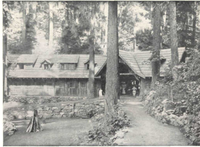
Headquarters Building, Dining Room and Office