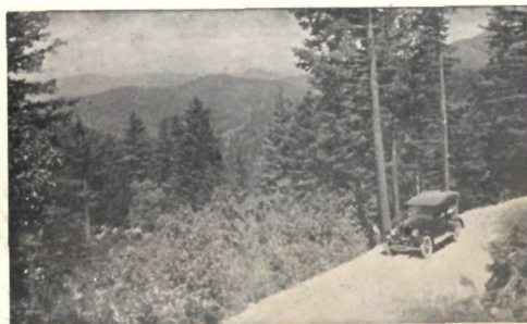
Forest Bordering Oregon Caves Road

Cottages and tent houses are furnished with high-grade beds. Hot and cold spring water is piped to each cottage and each has private bath and toilet. Electric lights within the buildings, and tent houses, also about the grounds. A huge campfire for those who enjoy the evening with song and story is a regular evening feature. Those who spend evenings at the Oregon Caves among the big pines, will long remember it as a land of enchantment.