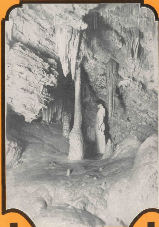
"JOAQUIN MILLER'S CHAPEL"

A National Monument SISKIYOU NATIONAL FOREST