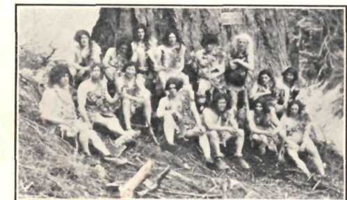
Cavemen at Dedication Ceremonial

Largest Douglas Fir Known Dedicated to the Oregon Cavemen Inc.