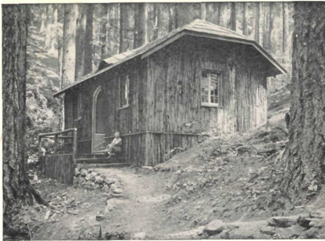
One of the Modern Rustic Cottages