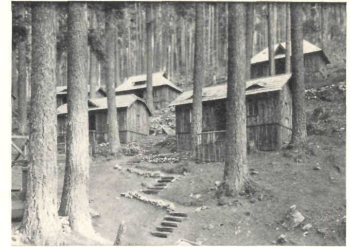
Group of Cottages—Each Has Private Bath