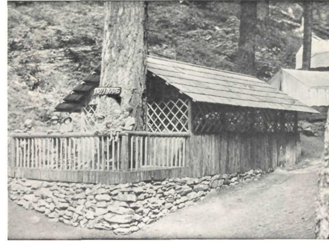
Kiddy Kave—Joy to the Little Folks