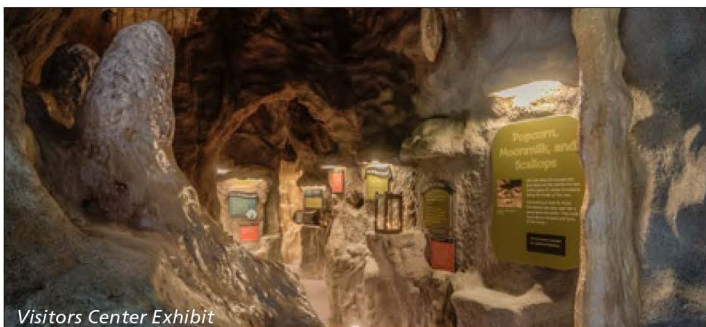
Visitors Center Exhibit