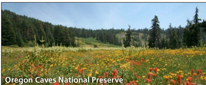
Oregon Caves National Preserve