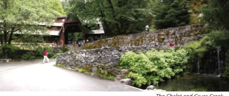
The Chalet and Caves Creek