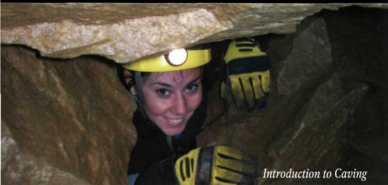
Introduction to Caving