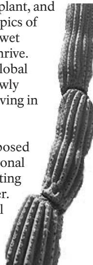
Frost-damaged organ pipe stem.

Here, the organ pipe cacti were exposed to colder winter nights, with occasional sub-freezing temperatures, preventing its range from extending any further. Sub-freezing temperatures will kill young tissue at the top of the stems. If the freeze is short, the cacti will survive with only the