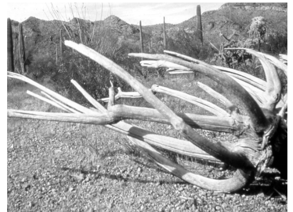
Skeleton of an organ pipe cactus.

As the first European pioneers ventured west in the 17th century, they encountered the chuhuis , and to them- it looked familiar. When looking at the exposed skeleton of the chuhuis , the pioneers were reminded of the large musical pipe organs that adorn the cathedrals of Europe. To them, the chuhuis was now known as the organ pipe cactus.