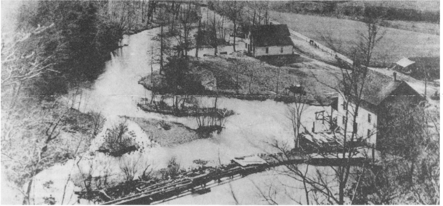
Alley Mill as viewed from the bluff above Alley Spring circa 1900