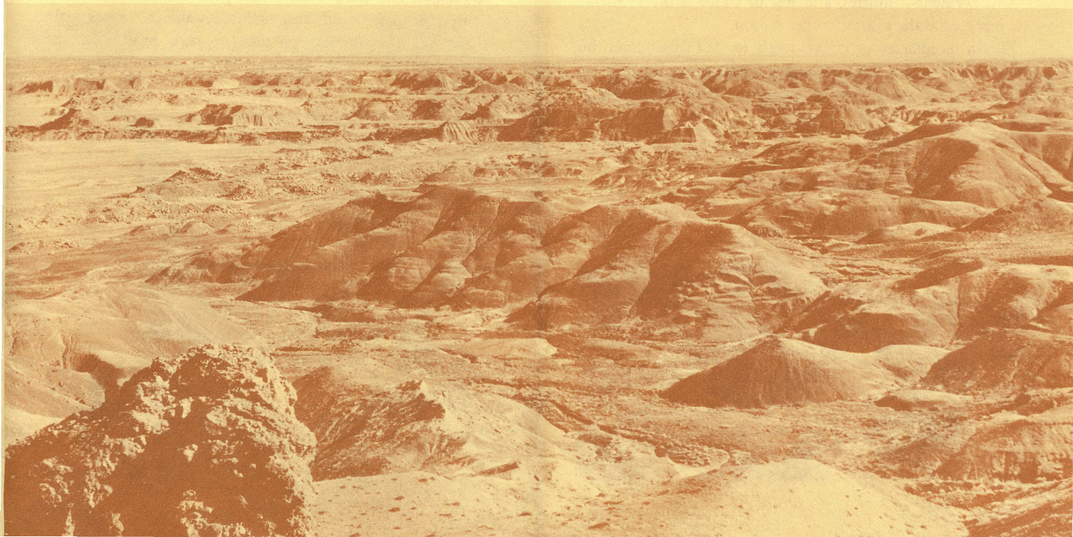
Painted Desert badlands.

About 160 million years ago, in the Triassic period, much of northern Arizona was swampy lowland where shifting streams spread sand and mud on vast flood plains. Dense beds of ferns, giant horsetails, clubmosses, and swamp-growing trees grew in the marshlands and along the streams. Trees of the most common fossil species grew in scattered copses on the occasional hills and ridges that were above the water. This species resembled our modern native pines, but it is most closely related to the araucarian "pines" of the Southern Hemisphere. Remains of several other kinds of primitive trees are also found here.