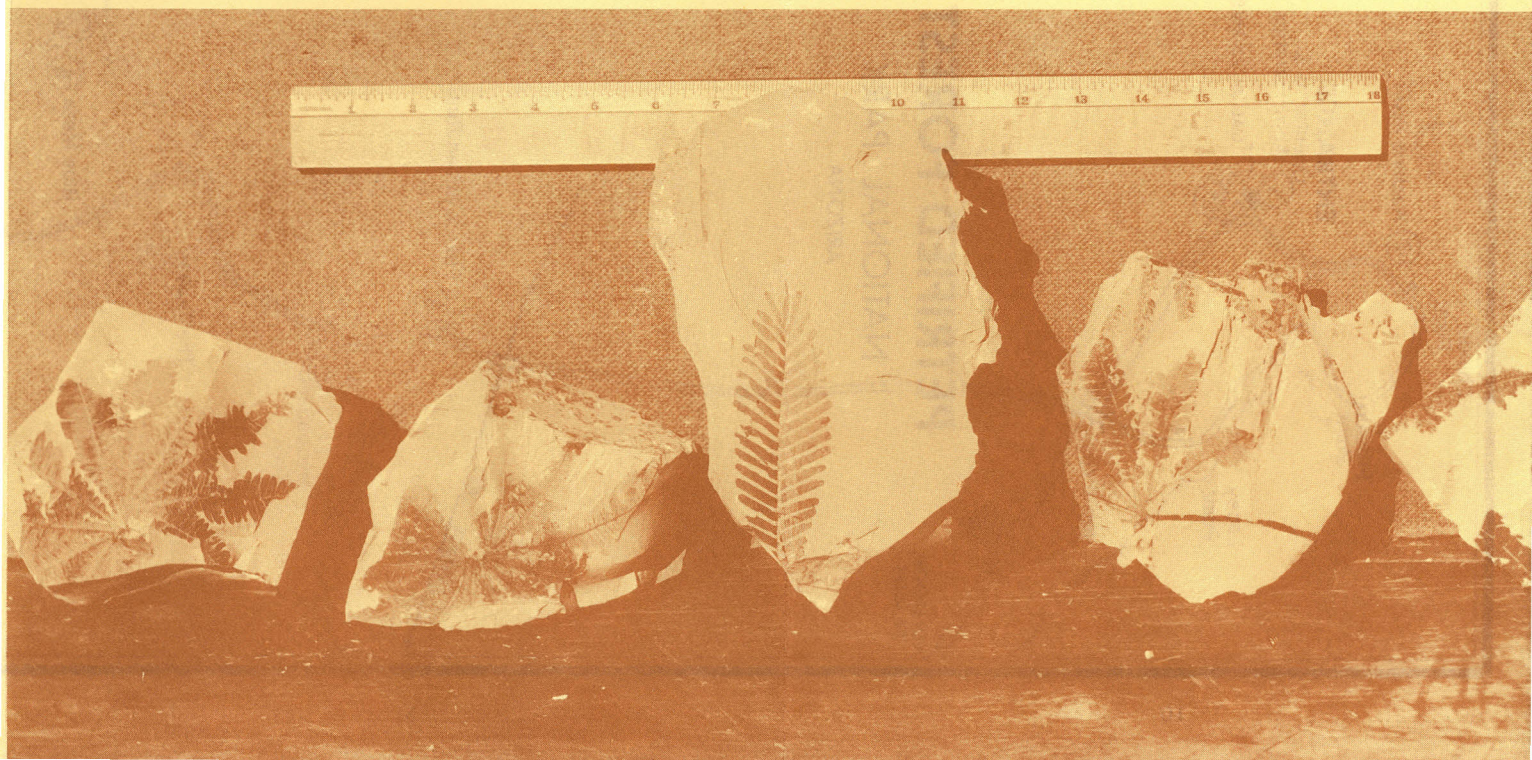
Fossil impressions of leaves in shale.

Now, turn to page 10, examine the map, and prepare for your first stop, which will be at ① if you enter the park from U.S. 66 or at ⑬ if you enter from U.S. 180.