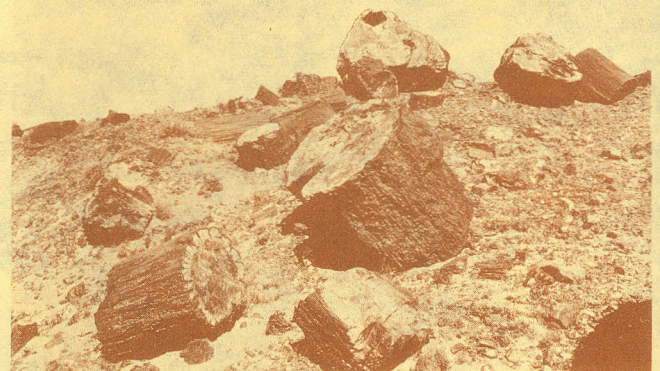
Broken log sections.

Trash receptacles are conveniently located throughout the park, and you can obtain trash bags at either entrance station. Please dispose of all refuse properly. Cleanliness begets cleanliness.