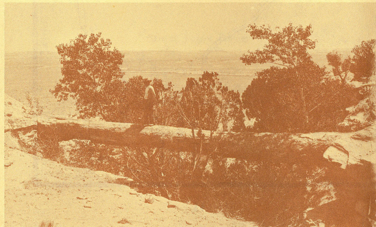
Agate Bridge in 1899.

Hard and strong when dry, bentonite will, however, absorb water like a sponge and with enough moisture will disintegrate into a fine flowing mud. Thus it is that in this semiarid region, with its long dry season and its torrential summer rains, the bentonitic beds are rapidly cut into tur-