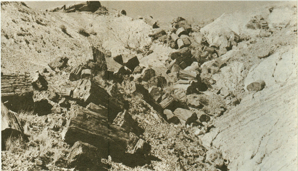
Petrified logs in Rainbow Forest