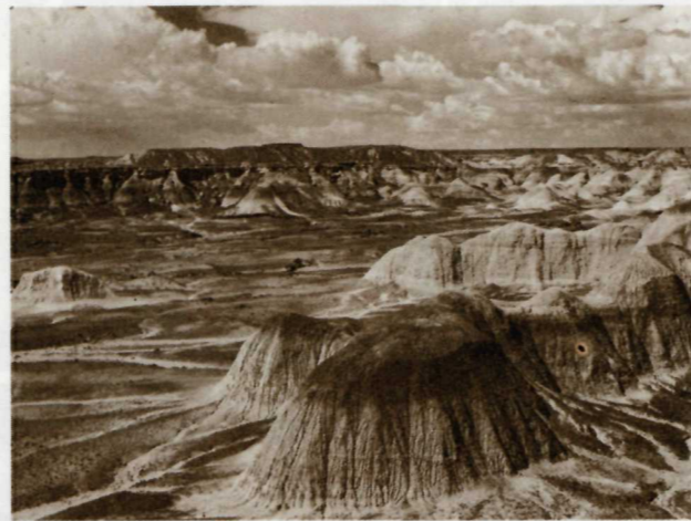
A view of the Rainbow Forest

Prehistoric Indians lived here and built their homes with petrified wood. Surviving are ruins of these dwellings, as well as their petroglyphs (drawings and signs etched on stone).