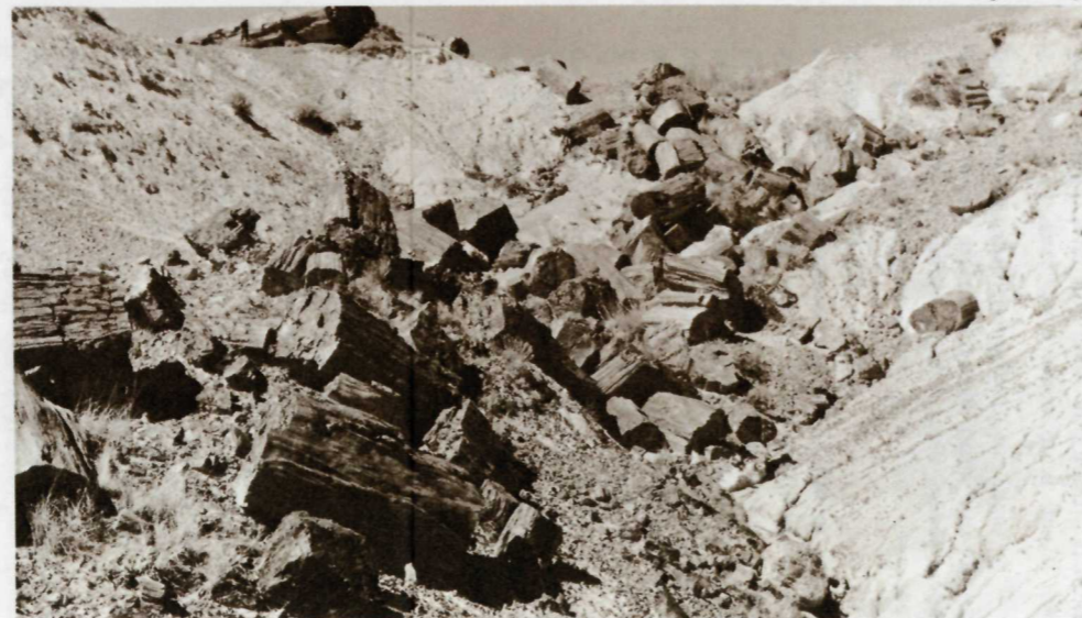
Petrified logs in Rainbow Forest