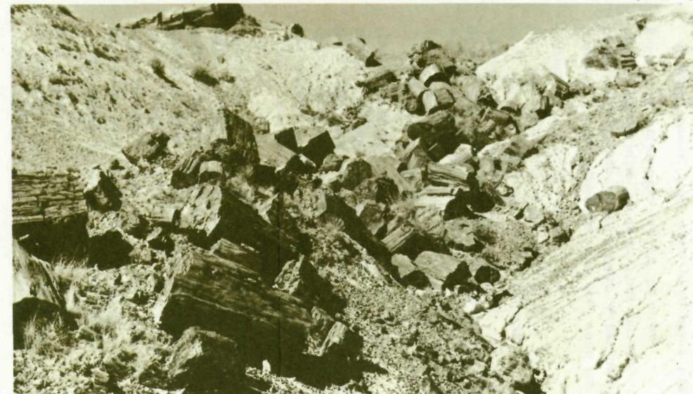
Petrified logs in Rainbow Forest