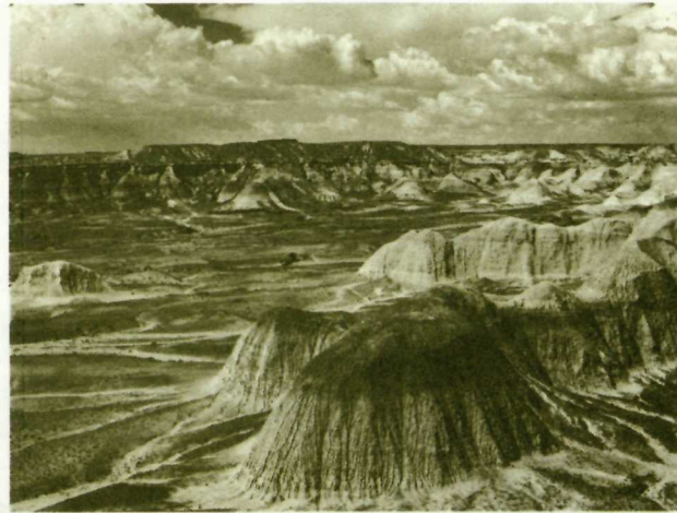
A view of the Rainbow Forest

Prehistoric Indians lived here and built their homes with petrified wood. Surviving are ruins of these dwellings, as well as their petroglyphs (drawings and signs etched on stone).