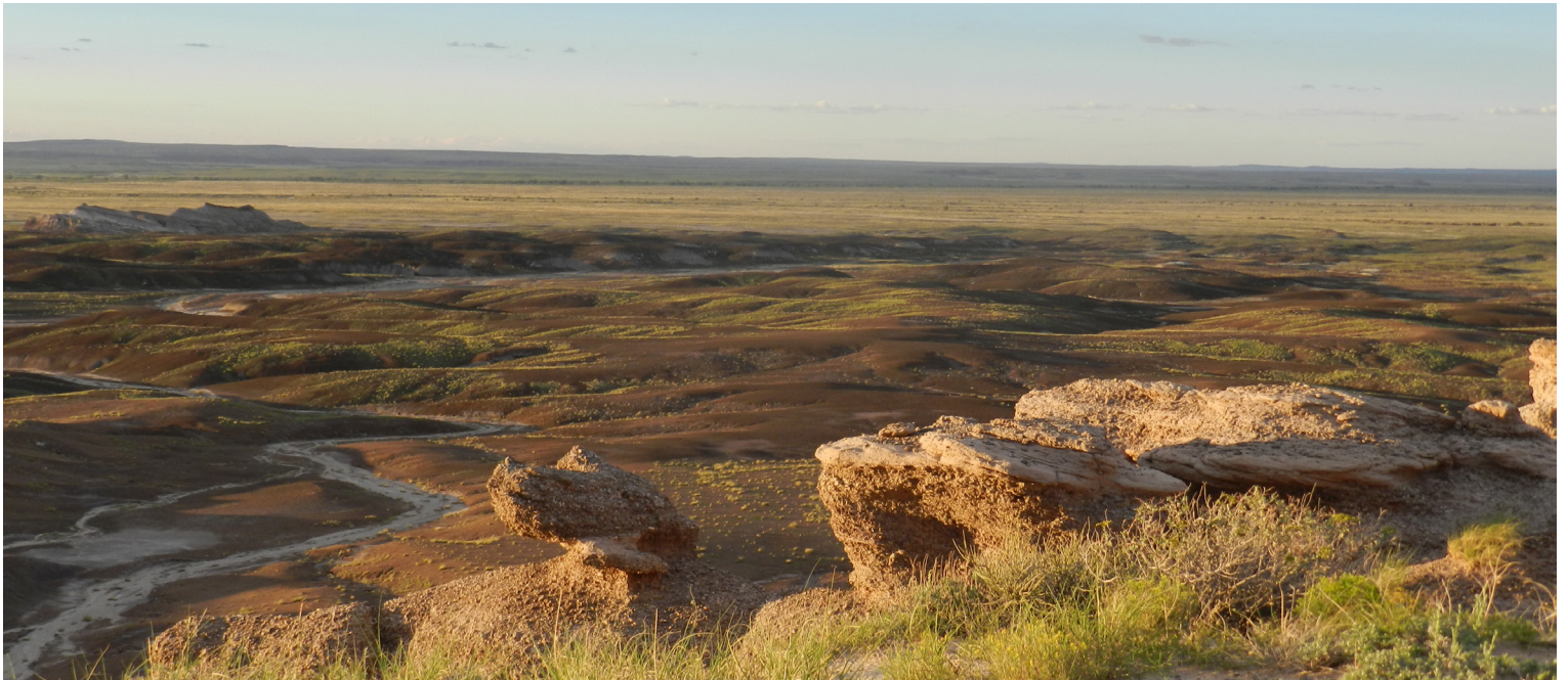
View from the Blue Mesa rim