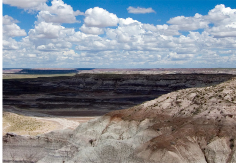
Blue Mesa rim looking east

This walk, although not strenuous, does require sturdy shoes. The footing can be difficult at any time—pay attention and don't walk too close to the steep rim edge. Do not attempt this hike if lightning is in the area. Please take normal hiking precautions and bring food and water, sun protection, and navigation aids. Pack out whatever you packed in. Do not attempt this hike if there is lightning nearby.