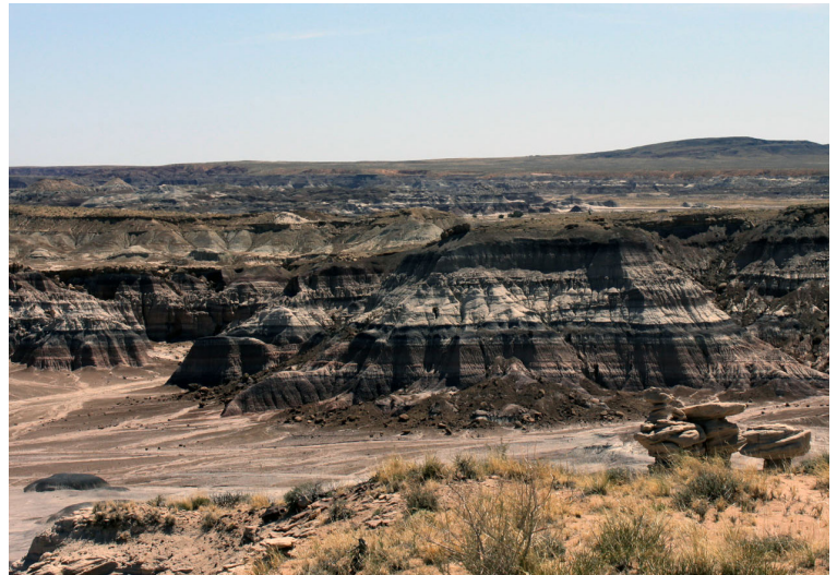
View of Billings Gap

The land associated with Billings Gap is part of the lands within the 2004 boundary expansion of Petrified Forest National Park. Many new archeological and paleontological discoveries have been made and are now protected in these lands. A hiking guide into this area is also available.