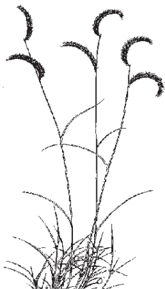
Blue grama grass

Achnatherum hymenoides Indian ricegrass Aristida purpurea var. longiseta Fendler threeawn, purple threeawn Bouteloua curtipendula var. curtipendula sideoats grama Bouteloua gracilis blue grama Bromus japonicus * Japanese brome Chloris virgata feather fingergrass Dasyochloa pulchella low woollygrass, fluffgrass Eragrostis intermedia plains lovegrass Hesperostipa comata var. comata needle and thread grass Leptochloa fusca ssp. fascicularis bearded sprangletop Muhlenbergia torreyi ring muhly Panicum obtusum obtuse panicgrass, vine mesquite