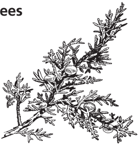
One seed juniper

Elaeagnus angustifolia * Russian olive Juniperus monosperma one seed juniper Juniperus osteosperma Utah juniper Pinus edulis twoneedle pinyon, pinyon pine Populus angustifolia narrowleaf cottonwood Populus deltoides ssp. wislizeni Fremont cottonwood