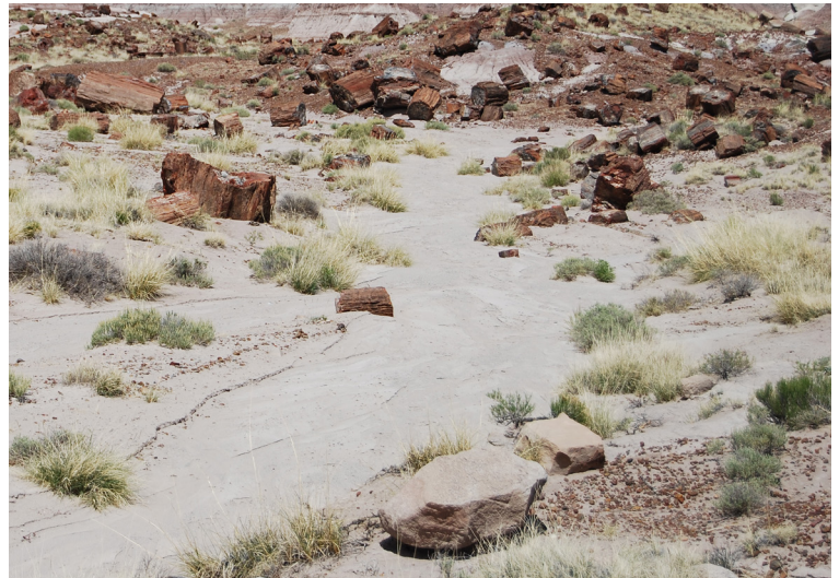
The historic road bed is shown in the bottom right corner