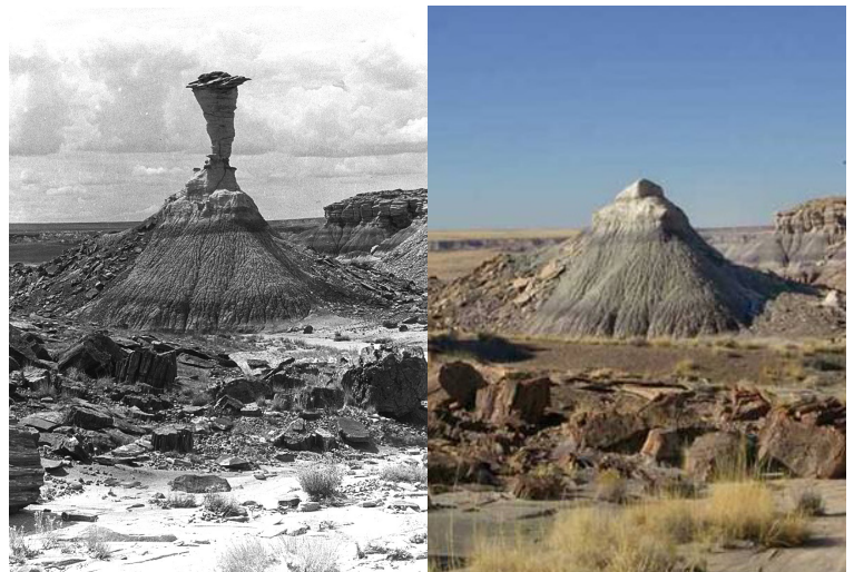
Eagle Nest Rock then and now