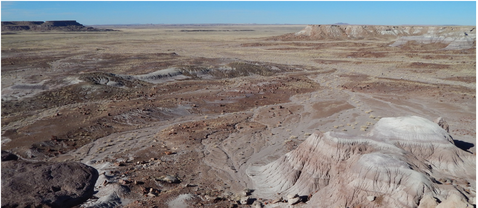
View from the Jasper Forest Overlook