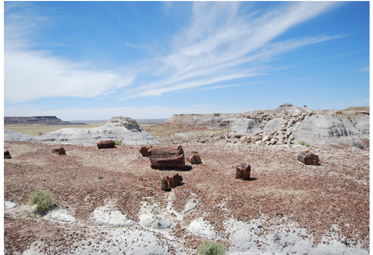
View looking northwest

The end of the road looped around a geological feature called Eagle Nest Rock. The feature fell in January 1941 after a period of unusually heavy rain. However, you can still see the base in the center of the loop.