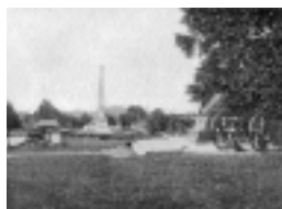
FIGURE 2: Among the hundreds of monuments at Gettysburg, these stand near the Copse of Trees on the right—the apex of the famed Pickett's Charge, the Confederate assault against massed Union forces on the final day of the battle. This site, long known as the "High Water Mark of the Confederacy," is shown in a ca. 1913 image.

Located in Pennsylvania, far from the main theaters of war, and the site of a critical and dramatic Union victory that repulsed the invasion of the North by the Confederate forces under General Robert E. Lee, the battlefield at Gettysburg clearly had the potential to inspire creation of a shrine to the valor and sacrifices of Union troops. The conditions were just right: Gettysburg quickly emerged as a hallowed landscape for the North, as it ultimately would for the nation as a whole. (Figure 2) In the beginning, the commemoration at Gettysburg was strictly limited to recognizing the Northern victory by preserving only Union battle lines and key positions. It was of course unthinkable to preserve battle positions of the Rebel army, with whom war was still raging.