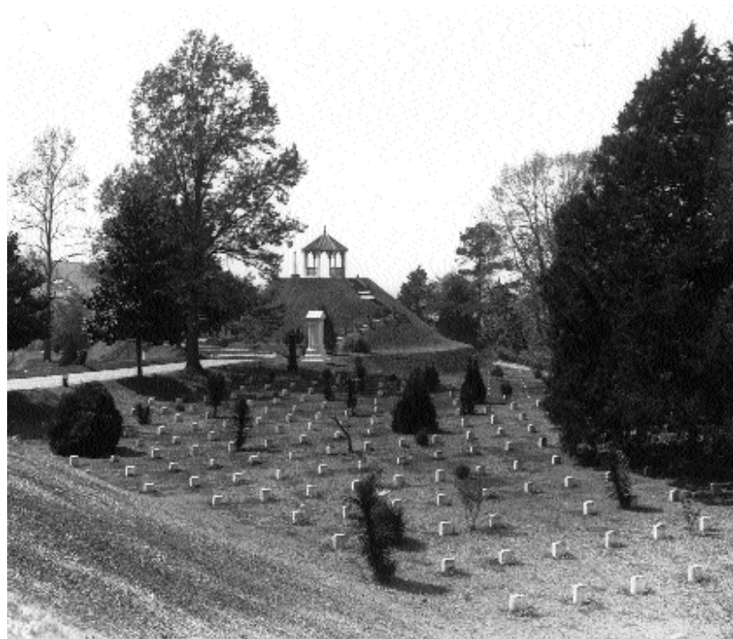
FIGURE 3 The national cemetery concept emerged during the Civil War to provide for the proper care of thousands of Union dead. Like formal military cemeteries on other Civil War battlefields, Vicksburg National Cemetery, established in 1866 and shown here ca. 1905, was gracefully landscaped to honor the Union soldiers and sailors buried there. Confederate dead were interred elsewhere, many of them in the Vicksburg city cemetery.

After the war ended, a systematic effort to care for the Northern dead led to the creation of many more military cemeteries, most of them established under the authority of congressional legislation approved in February 1867. This legislation strengthened the 1862 legal foundation for national cemeteries—for instance, by reauthorizing the purchase of lands needed for burying places; providing for the use of the government’s power of eminent domain when necessary for acquiring private lands; and calling for the reimbursement of owners whose lands had been, or would be, expropriated for military cemetery sites. The total number of national cemeteries rose from 14 at the end of the war to 73 by 1870, when the re-burial program for Union soldiers was considered essentially completed. Although many of the new official burial grounds were on battlefields or military posts, others were part of existing private or city cemeteries. Also, two prominent battlefield cemeteries that had been created and managed by states were transferred to the War Department: Pennsylvania ceded the Gettysburg cemetery in 1872, and Maryland transferred the Antietam cemetery five years later. 17