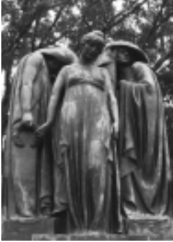
FIGURE 4 At Shiloh, this detail of the United Daughters of the Confederacy Monument erected in 1917 depicts three allegorical figures—The South, Death, and Night—symbolizing the course of the battle and expressing profound grief.

doned the African American population in the South to the mercy of those who had only recently held them as slaves. This situation opened the way for intensified discrimination against, and subjugation of, recently freed black citizens of the United States. In the midst of such fateful developments, the North-South rapprochement fostered a return to the battlefields by both Union and Confederate veterans—an echo of the past, but this time for remembrance and reconciliation, not combat. 28