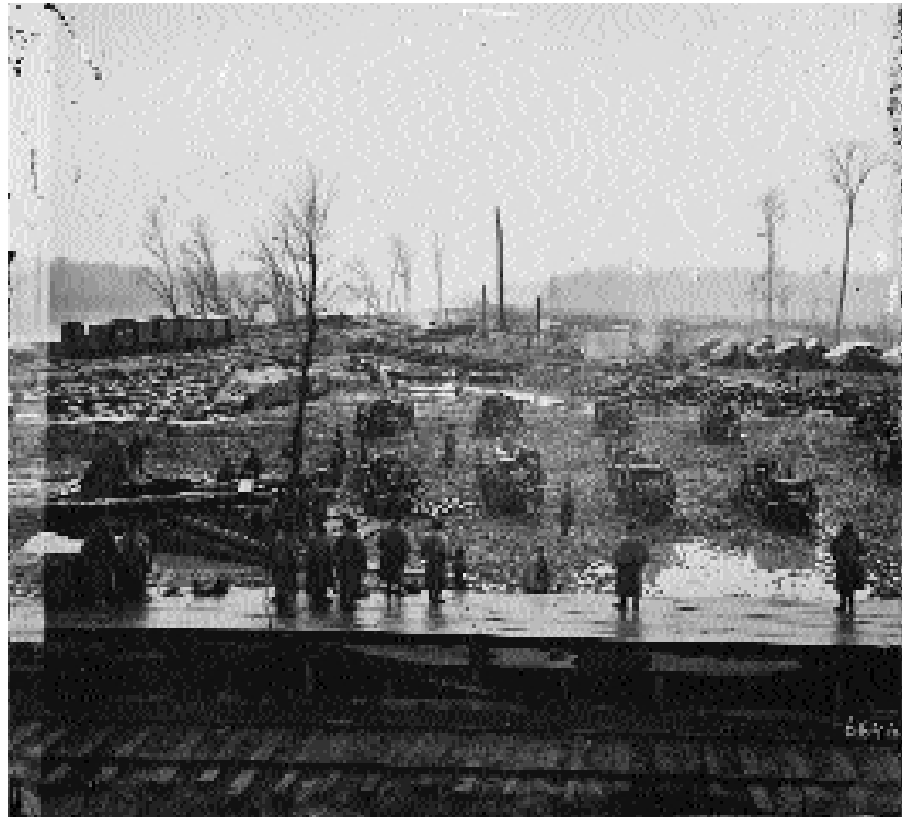
FIGURE 5 Until recent decades, African American contributions to the North's war effort received little public attention. Yet following the Emancipation Proclamation, nearly 180,000 blacks enlisted in the United States Army, including the troops shown here at a war-torn battleground in west-central Tennessee in 1864.

Union army. It is estimated that nearly 180,000 blacks joined the United States Army before the end of the war, more than half of them recruited from the Confederate states. They served mainly in infantry, cavalry, and heavy and light artillery units.