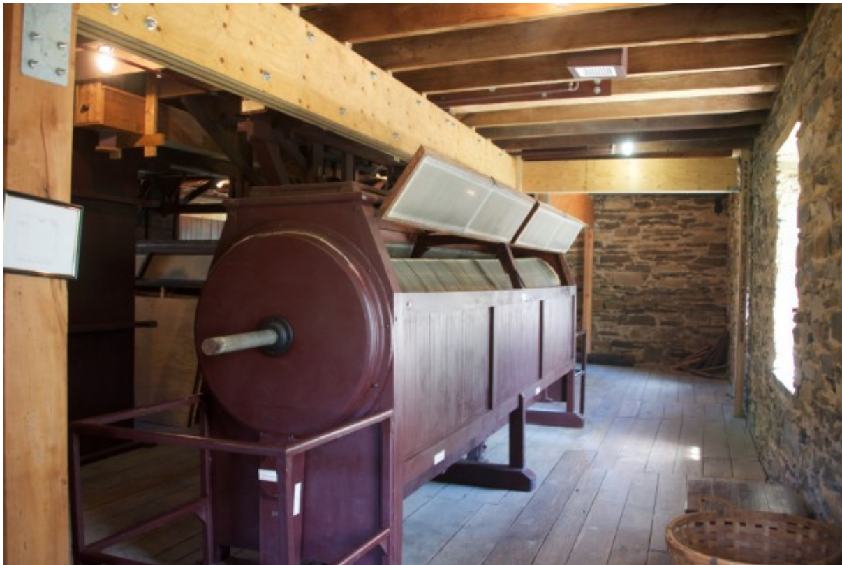
The bolter machine sifts flour.

The bolter was similar to the grain cleaner, with its rotating cylinder of screens, but the mesh in the bolter was graduated, with very fine mesh on one end, to allow only the finest flour through, to wider at the other end, to allow only coarser particles or bran to fall through. The bolter then dropped the different gradations of flour into different storage bins on the first floor, so they could be packed and given to the farmer in separate containers.