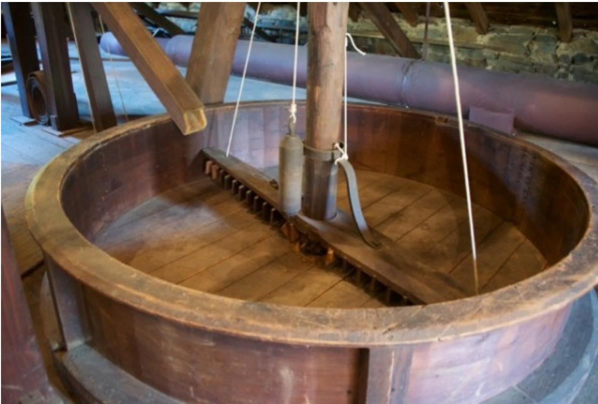
The hopper boy machine.

Evans knew this process of cooling and drying was a major cause of the bottle-necks in the milling process, so he invented a machine that could take the place of the boys and their rakes – a wooden tub with rotating rakes he named the hopper boy.